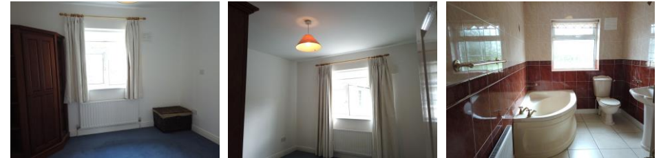
Bedroom 1 & 2 and Main Bathroom

Tiled floor to ceiling. WHB, WC, Bath and Shower.