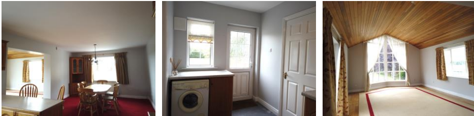
Dining Area, Utility Room & Living Area