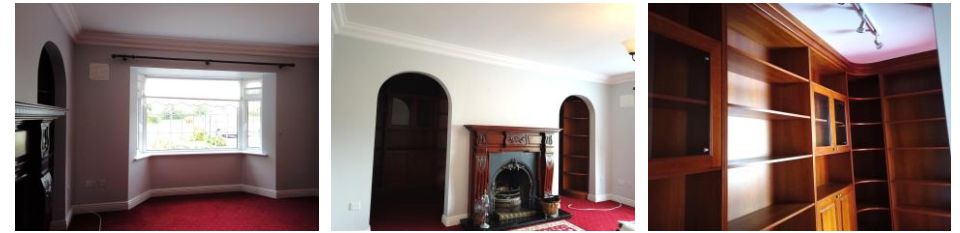
Sitting Room with feature wall behind fireplace – shelved units/bookcase behind.

Carpet flooring. Fireplace. Built in units. Feature behind fireplace/ arch both sides of fireplace. Cornicing. Bay window. Room/space to rear.