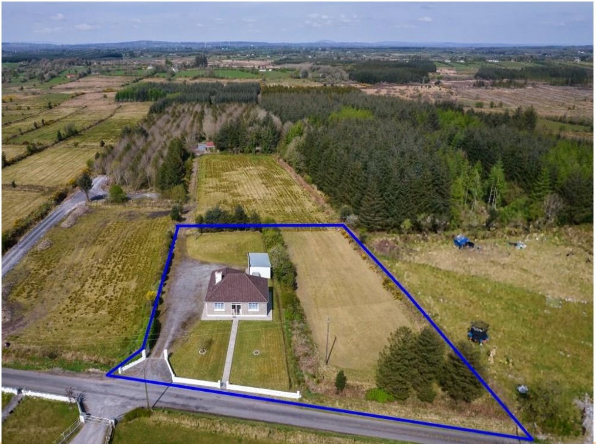
Breanmore, Loughglynn, Co. Roscommon. F45 PN29