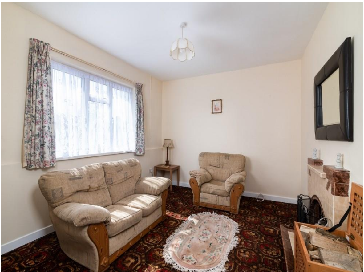
Breanamore, Loughglynn, Co. Roscommon. F45 PN29