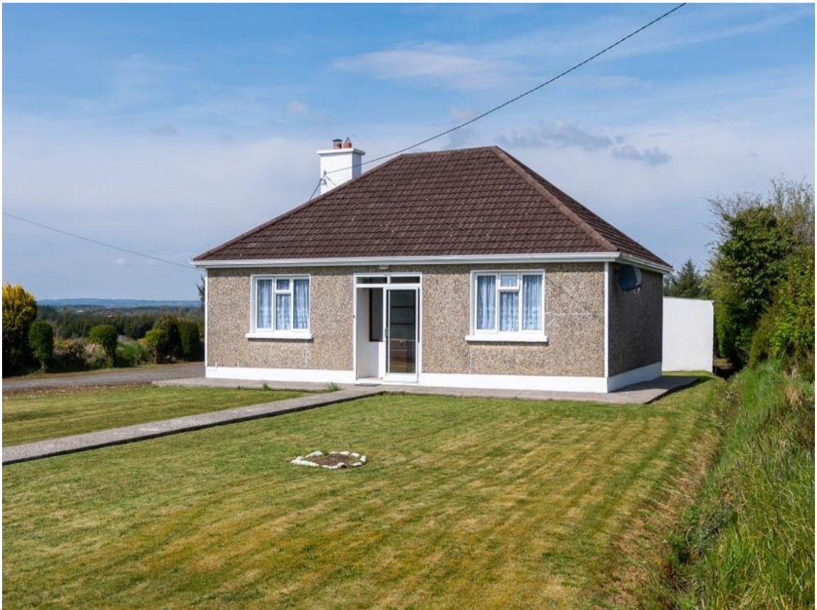
Breanamore, Loughglynn, Co. Roscommon. F45 PN29