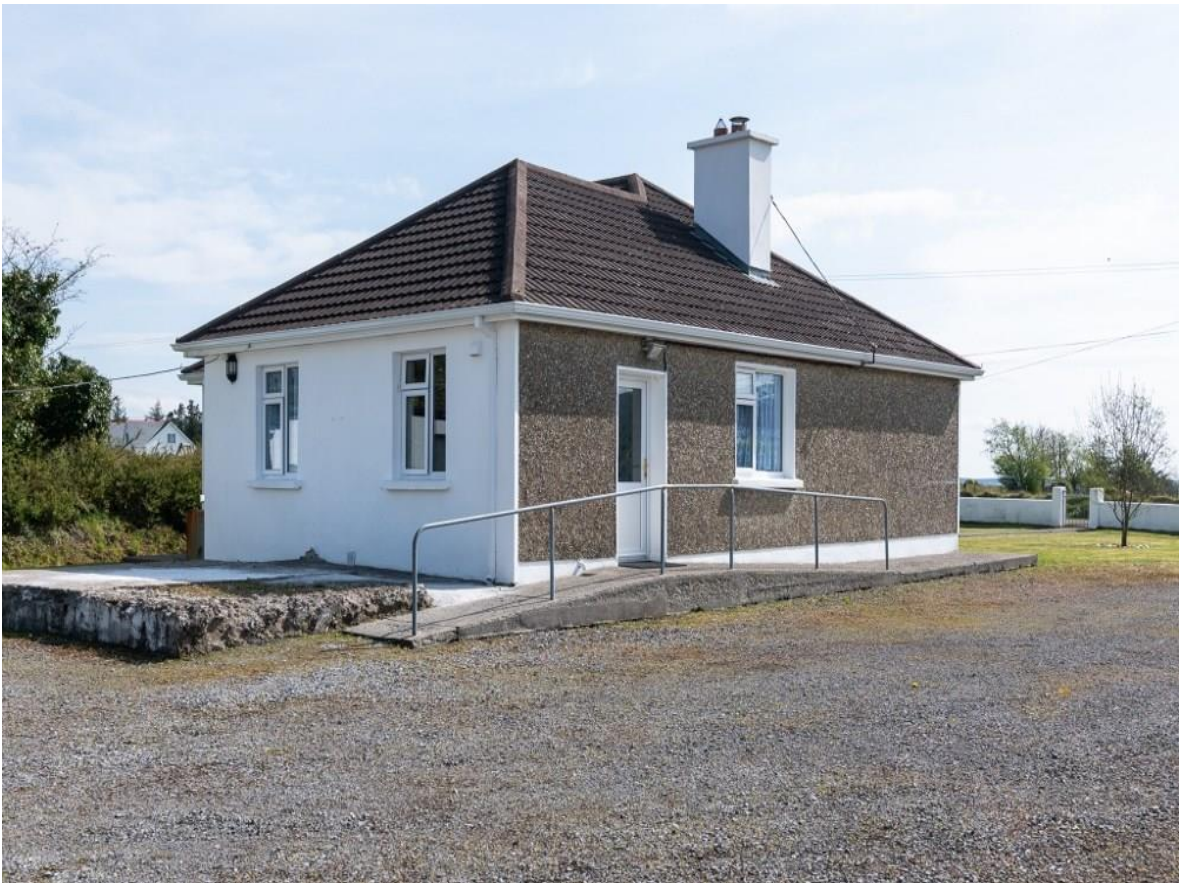
Breanamore, Loughglynn, Co. Roscommon. F45 PN29