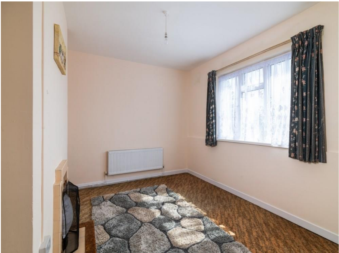
Breanamore, Loughglynn, Co. Roscommon. F45 PN29