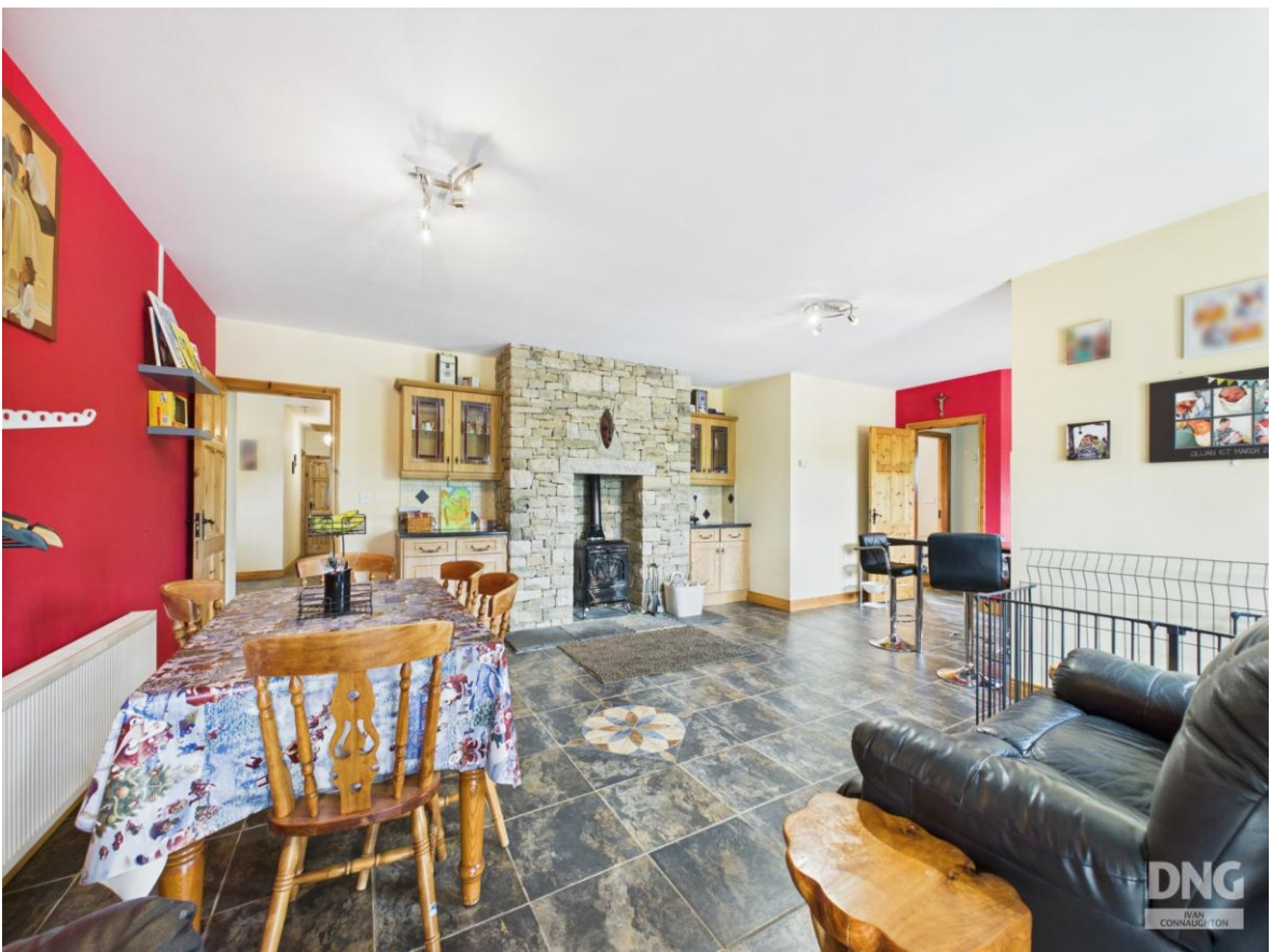
Laragh, Ballintubber, Co. Roscommon. F45 R229