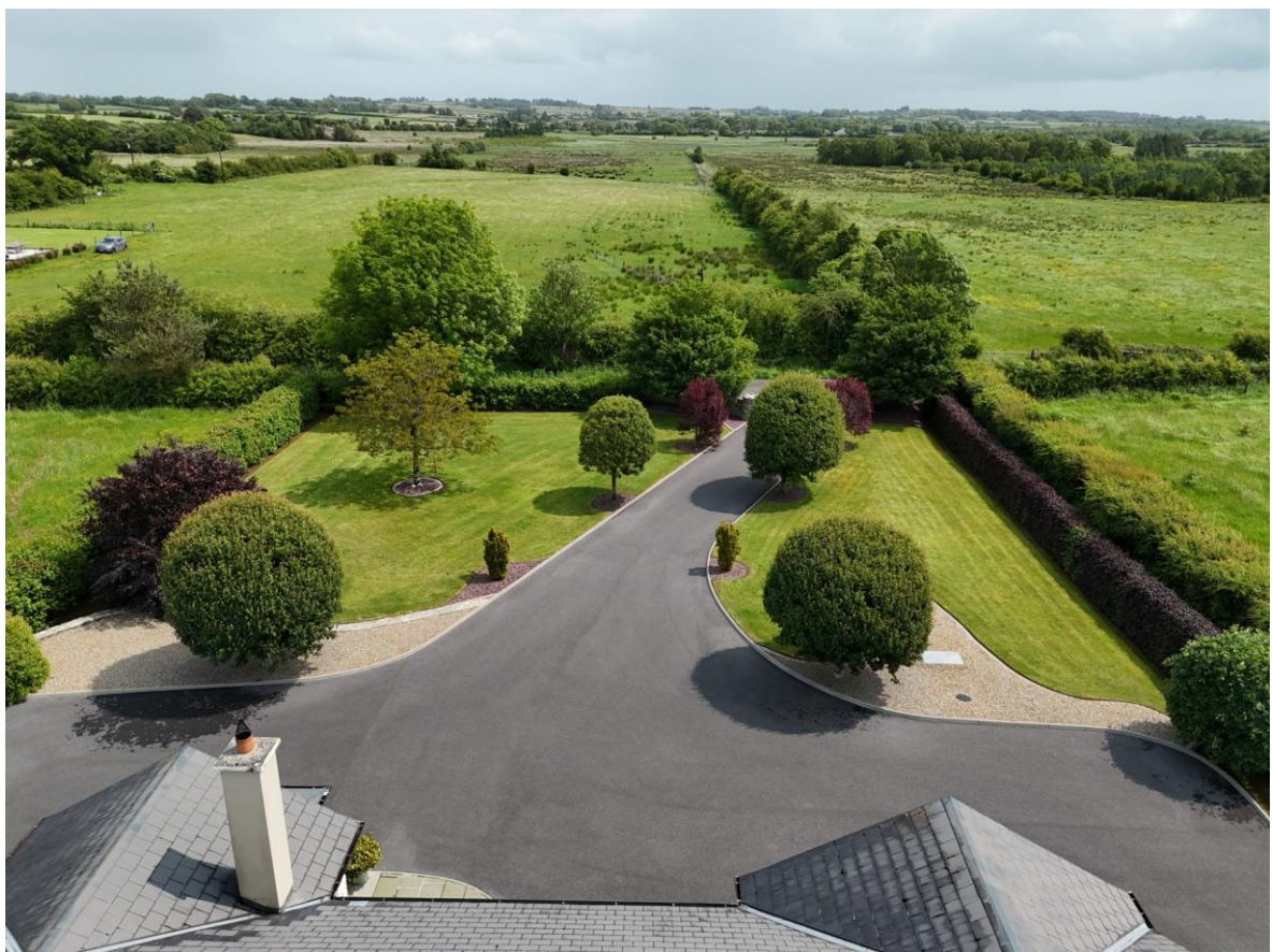
Laragh, Ballintubber, Co. Roscommon. F45 R229