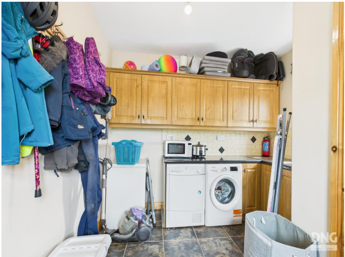
Laragh, Ballintubber, Co. Roscommon. F45 R229