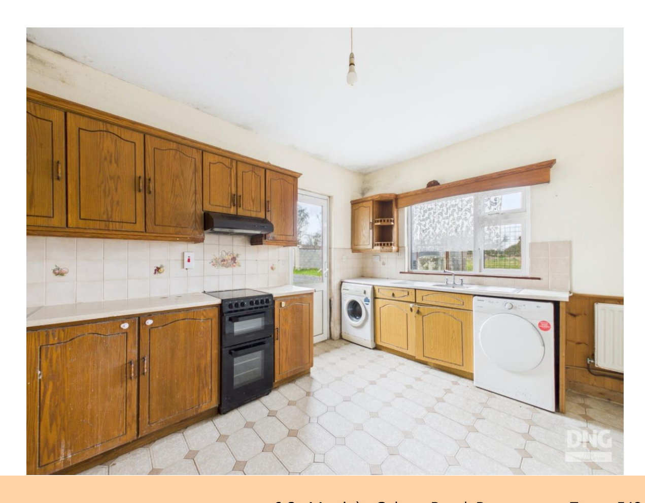
6 St. Martin`s, Galway Road, Roscommon Town. F42 HY46