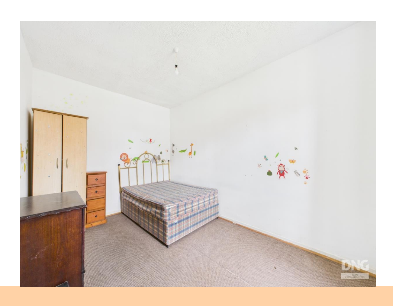
6 St. Martin's, Galway Road, Roscommon Town. F42 HY46