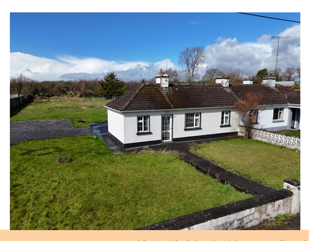
6 St. Martin`s, Galway Road, Roscommon Town. F42 HY46