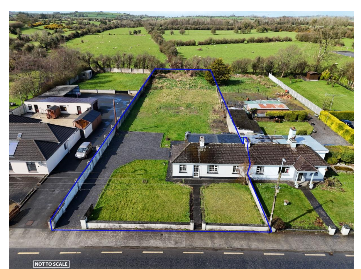
6 St. Martin`s, Galway Road, Roscommon Town. F42 HY46