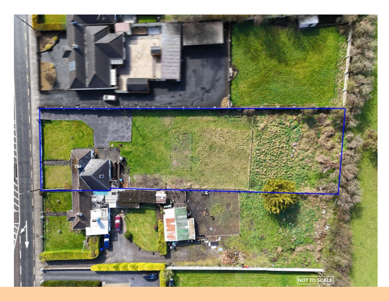
6 St. Martin's, Galway Road, Roscommon Town. F42 HY46