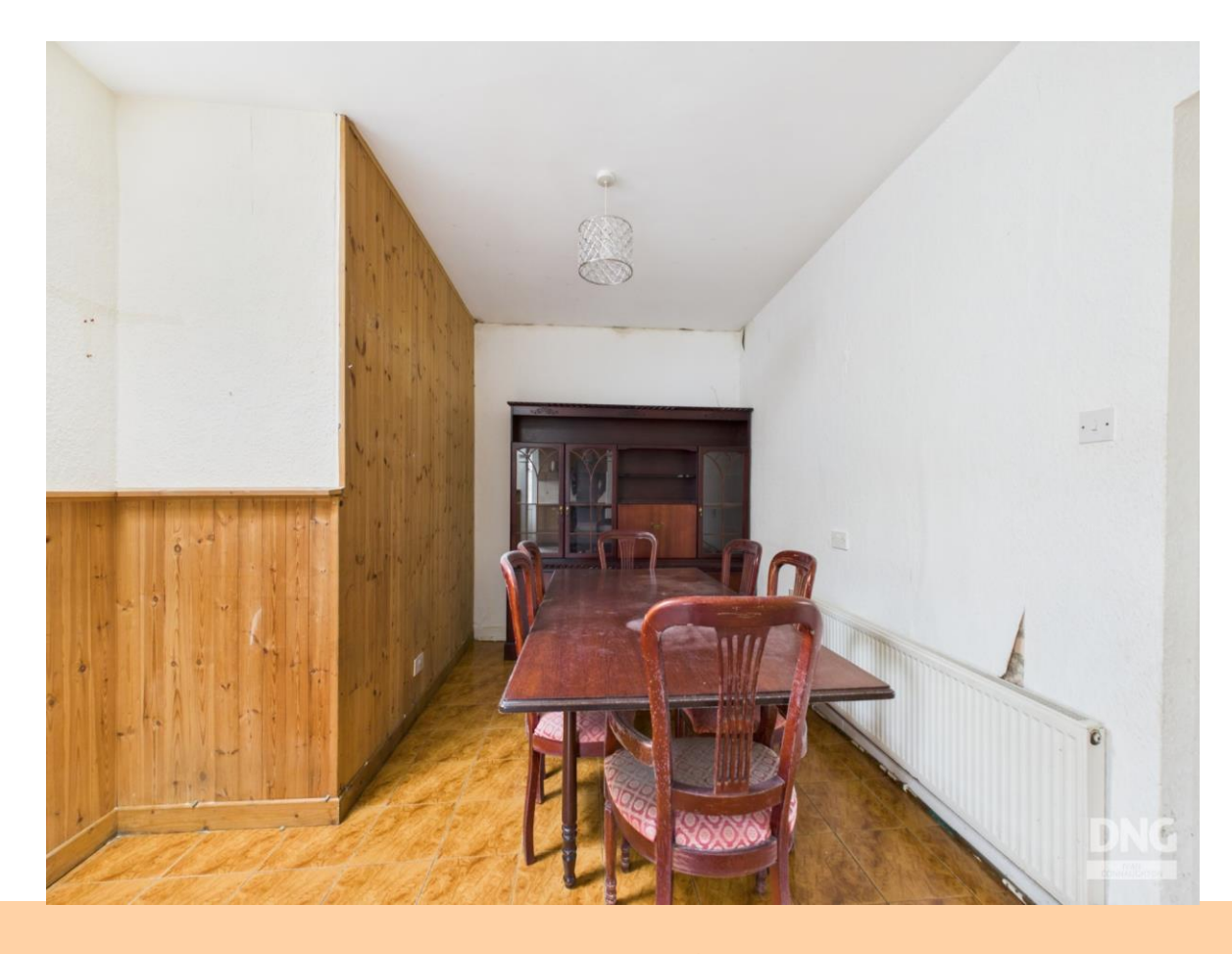
6 St. Martin`s, Galway Road, Roscommon Town. F42 HY46