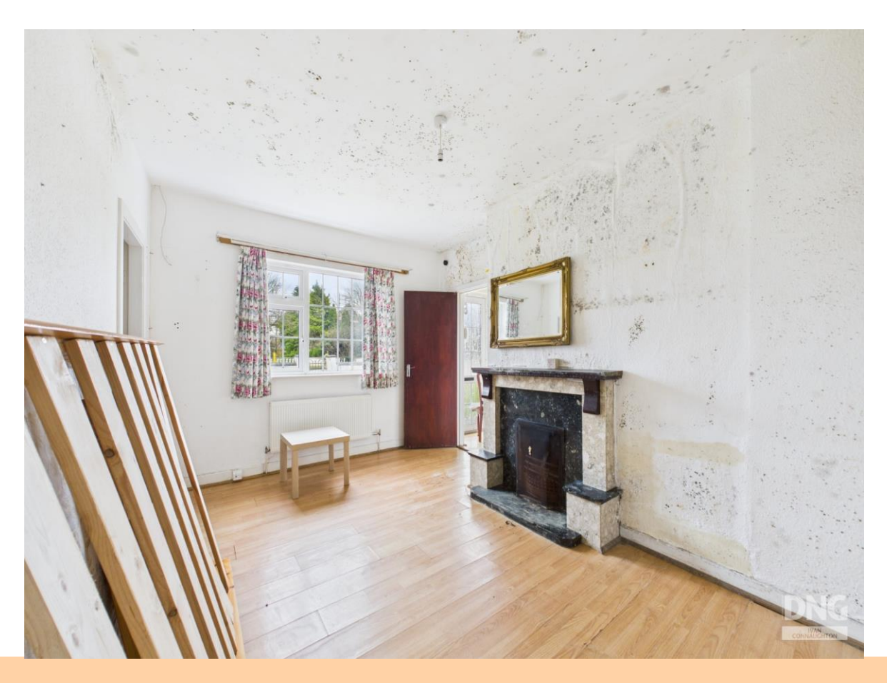
6 St. Martin`s, Galway Road, Roscommon Town. F42 HY46