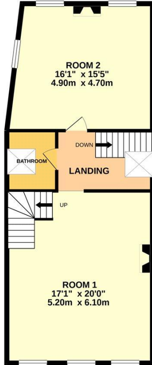
1ST FLOOR 687 sq.ft. (63.9 sq.m.) approx.