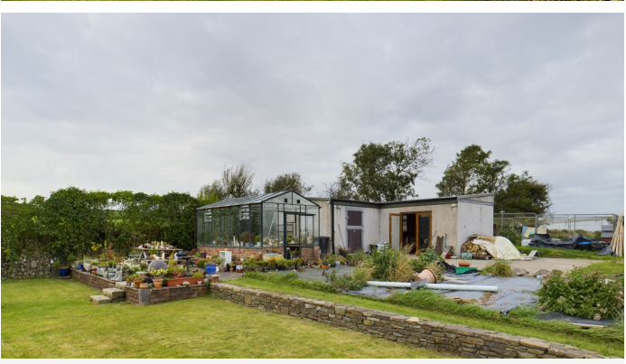
Messrs. Cohalan Downing, for themselves and for the vendors of this property whose agents they are, give notice that: (i) the particulars are produced in good faith, are set out as a general guide only and do not constitute any part of a contract, (ii) no person in the employment of Messrs. Cohalan Downing has authority to make or give any representation or warranty whatever in relation to the property.