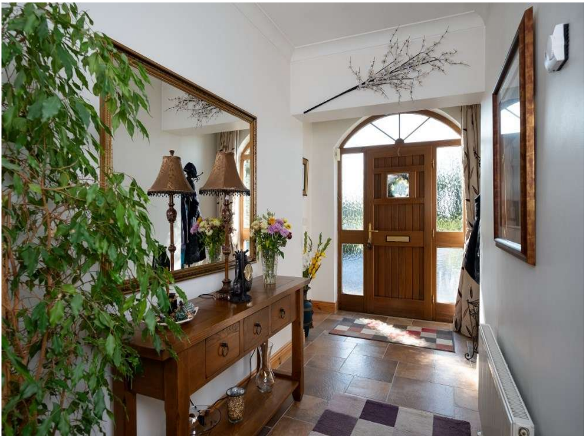
Ballyboughan (Ballybride), Roscommon Town. F42 XN63