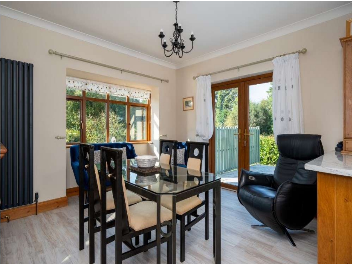
Ballyboughan (Ballybride), Roscommon Town. F42 XN63