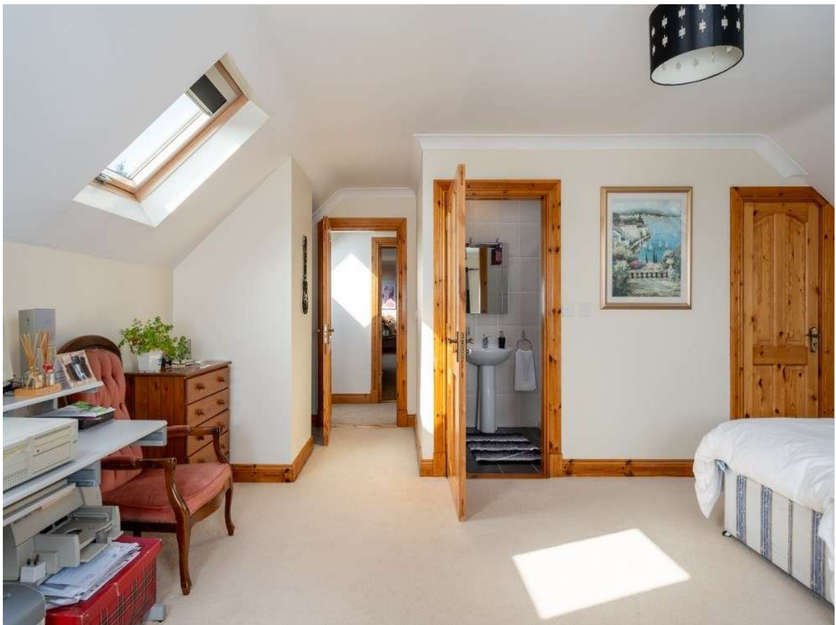
Ballyboughan (Ballybride), Roscommon Town. F42 XN63