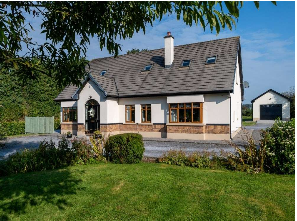
Ballyboughan (Ballybride), Roscommon Town. F42 XN63