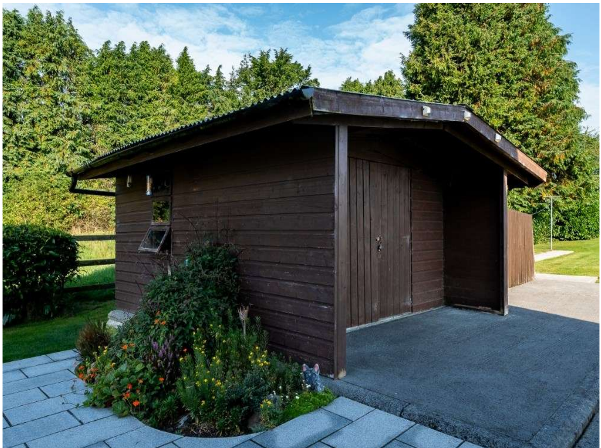
Ballyboughan (Ballybride), Roscommon Town. F42 XN63