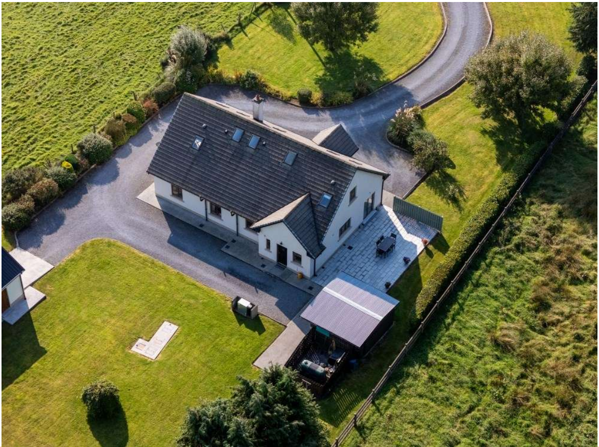
Ballyboughan (Ballybride), Roscommon Town. F42 XN63