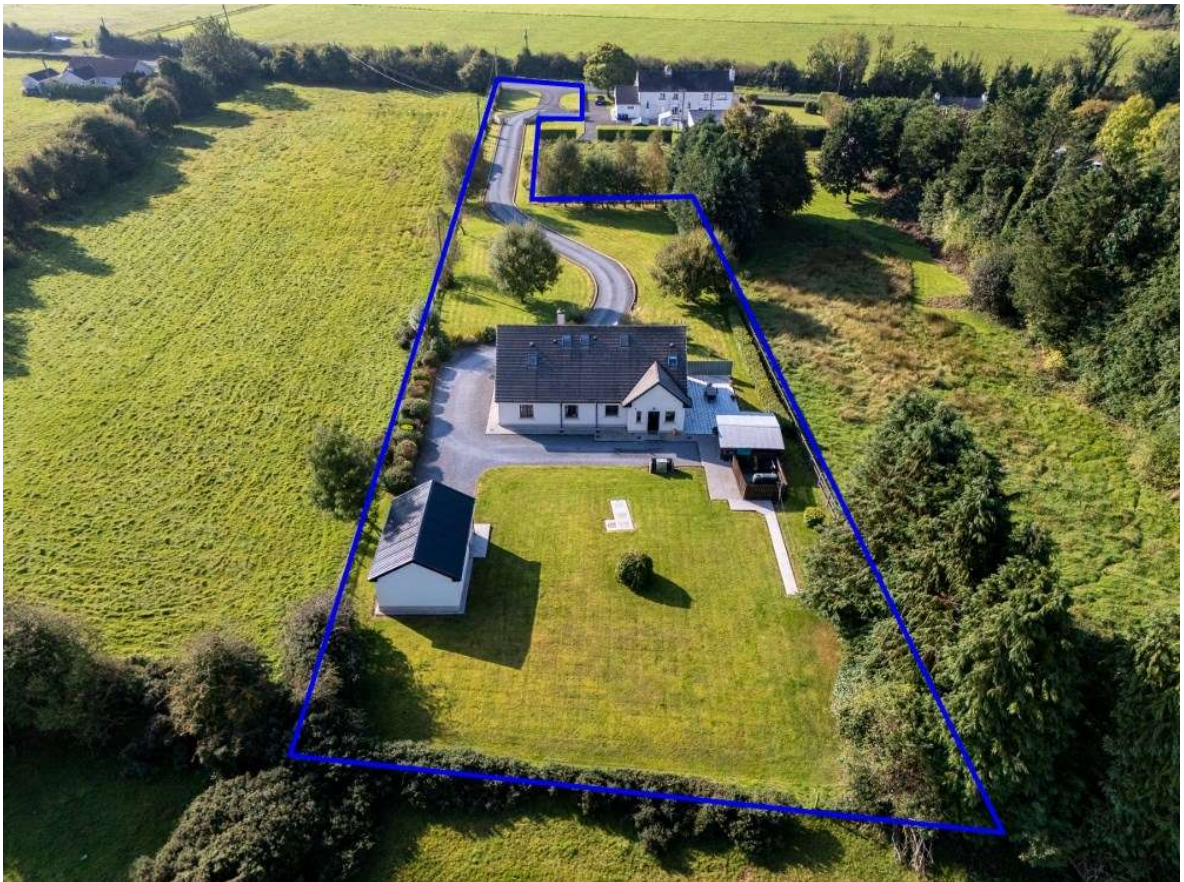
Ballyboughan (Ballybride), Roscommon Town. F42 XN63