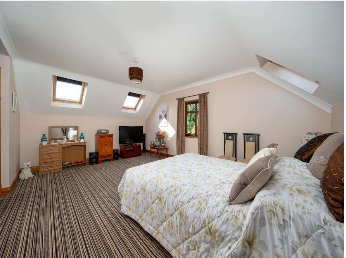
Ballyboughan (Ballybride), Roscommon Town. F42 XN63