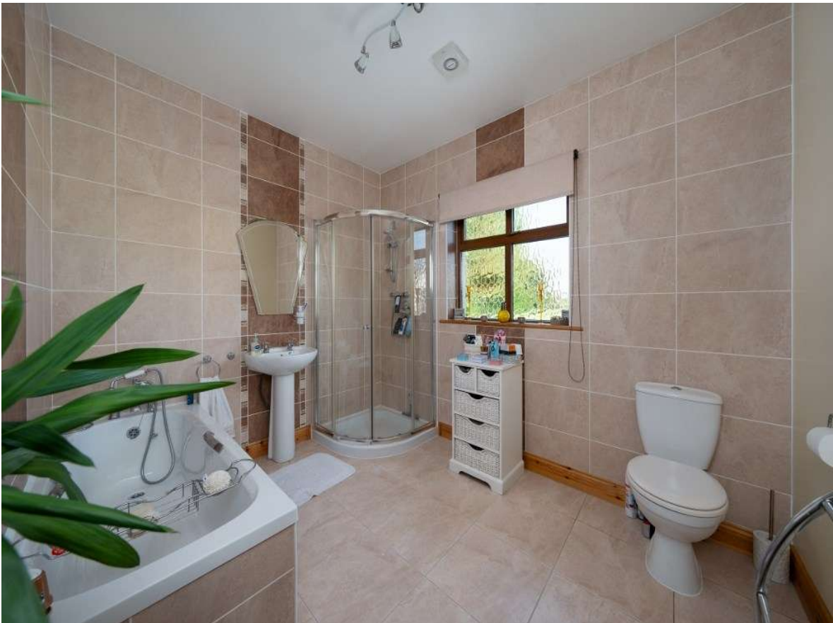
Ballyboughan (Ballybride), Roscommon Town. F42 XN63