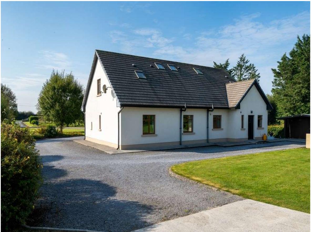
Ballyboughan (Ballybride), Roscommon Town. F42 XN63