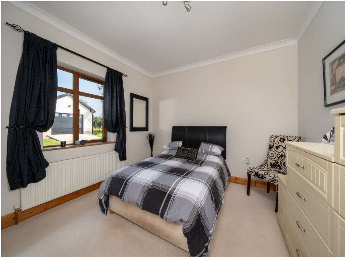
Ballyboughan (Ballybride), Roscommon Town. F42 XN63