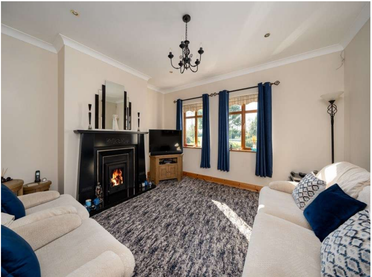
Ballyboughan (Ballybride), Roscommon Town. F42 XN63