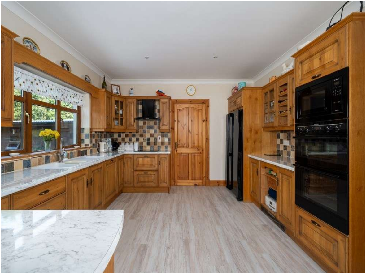
Ballyboughan (Ballybride), Roscommon Town. F42 XN63