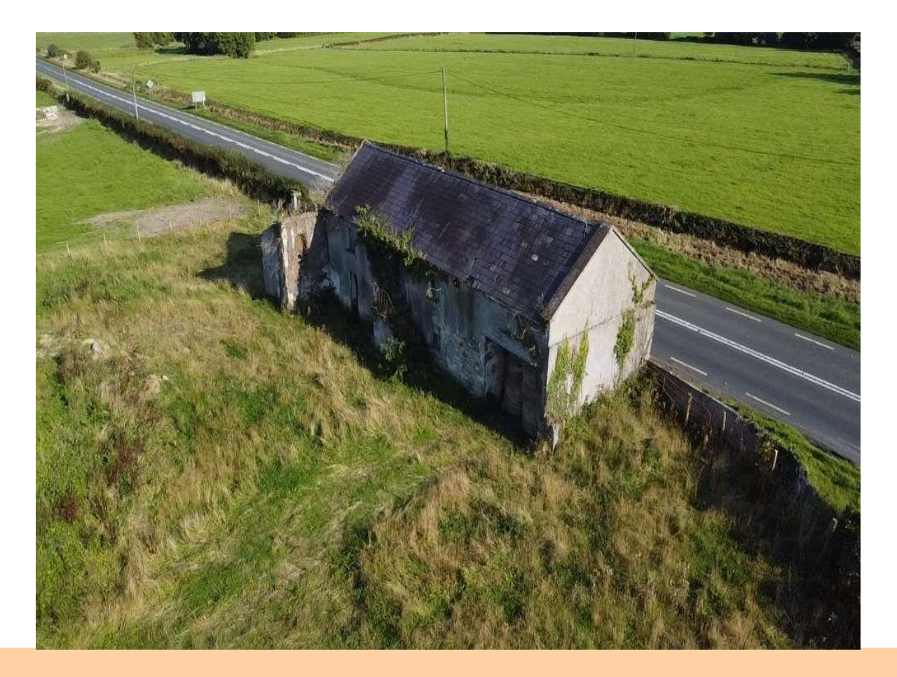
Residence On C. 0.50 Acres, Tonlegee, Kilrooskey, Co. Roscommon