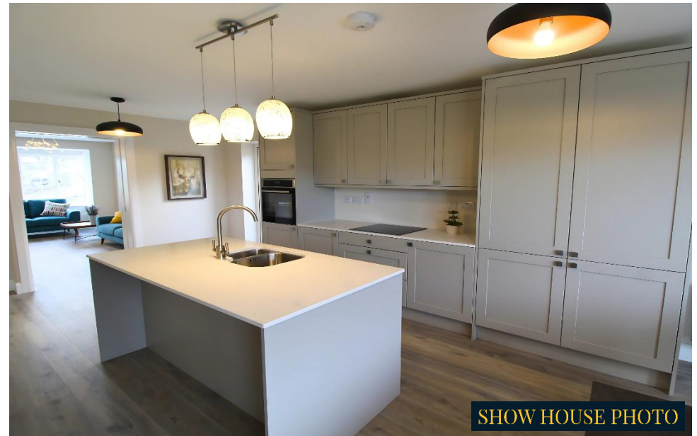
SHOW HOUSE PHOTO