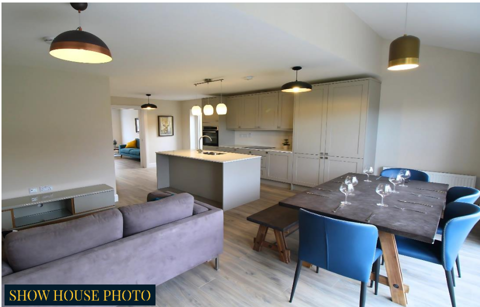
SHOW HOUSE PHOTO