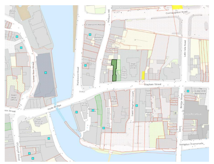
Site area indicated in green