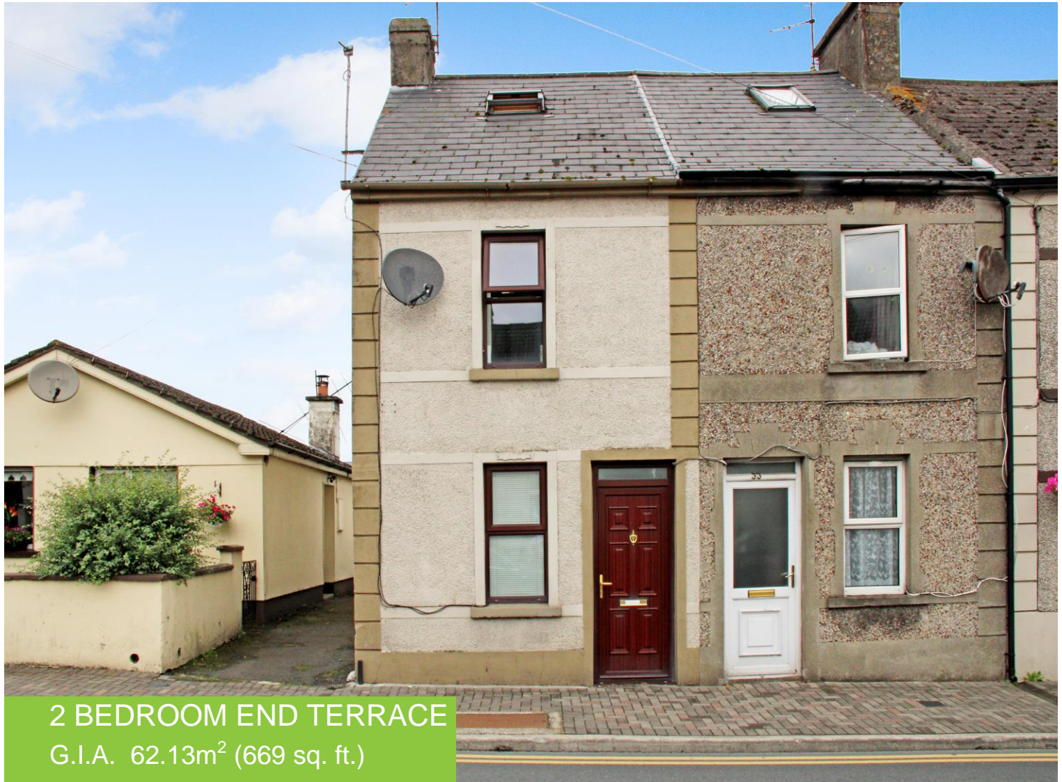
2 BEDROOM END TERRACE G.I.A. 62.13m 2 (669 sq. ft.)