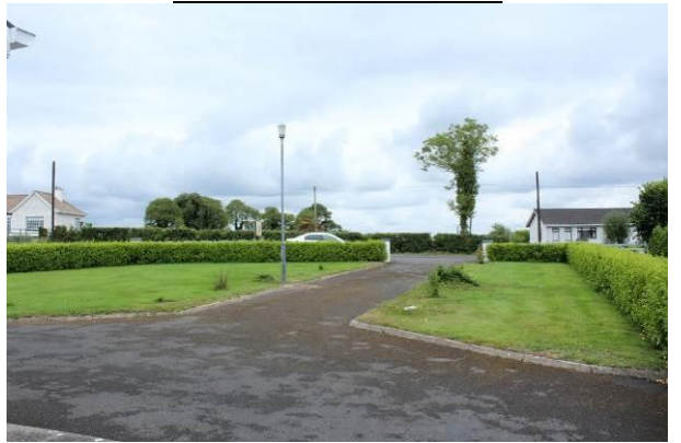
GARDEN TO FRONT