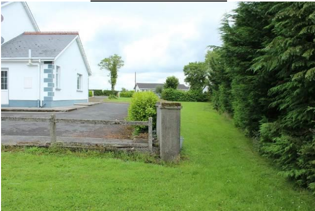
GARDEN TO SIDE