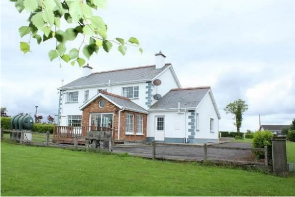
REAR VIEW OF PROPERTY