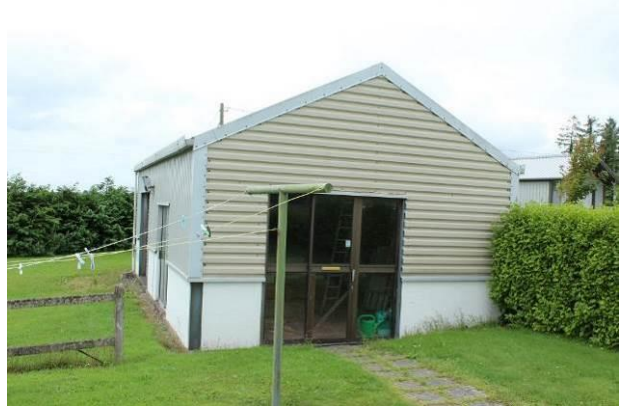
GARAGE/WORKSHOP TO REAR