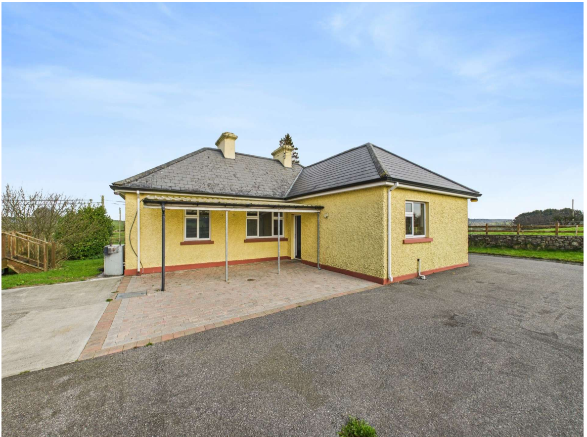
Mullaghroe, Gurteen, Co. Sligo. F56 KC99