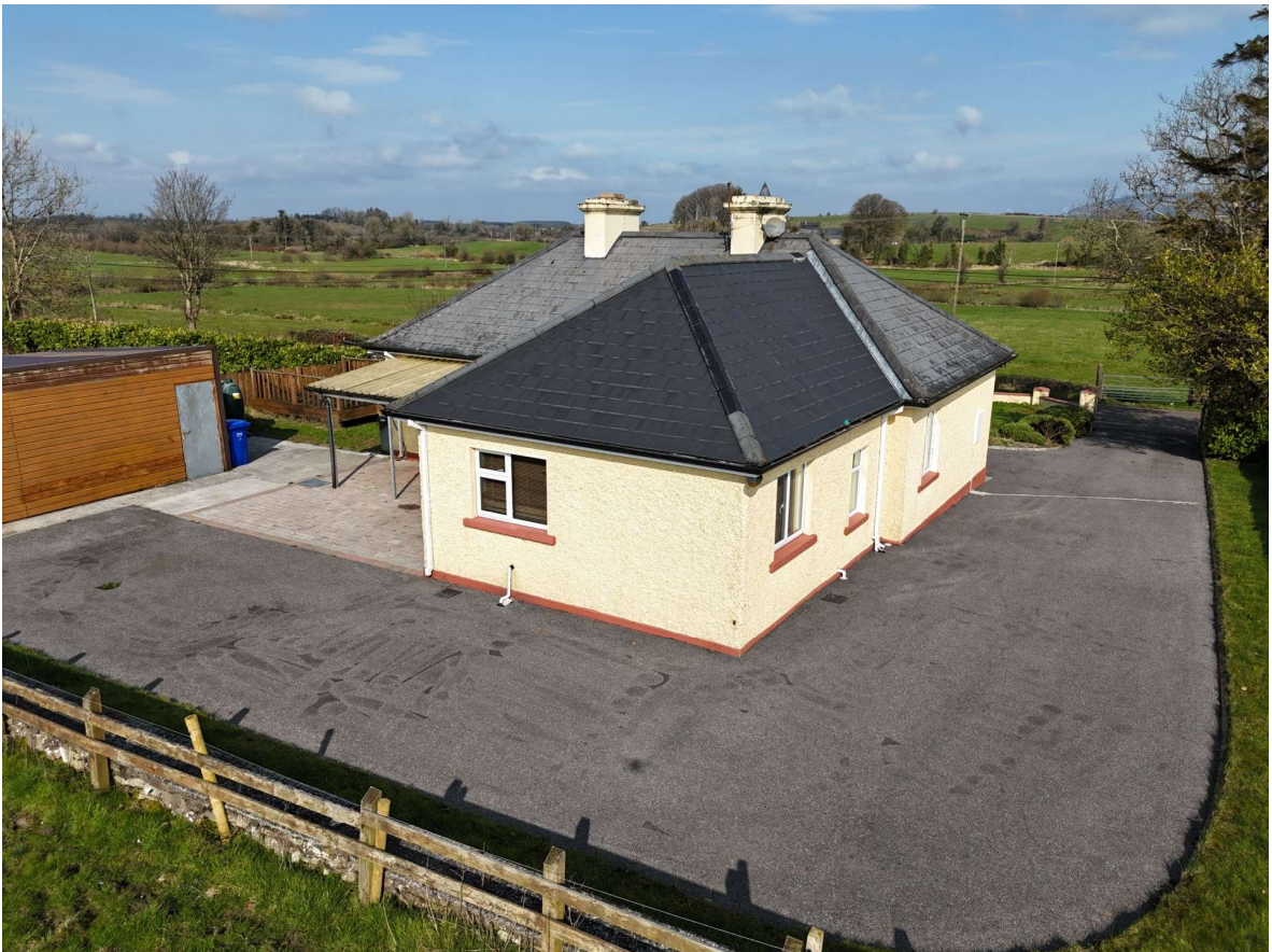
Mullaghroe, Gurteen, Co. Sligo. F56 KC99