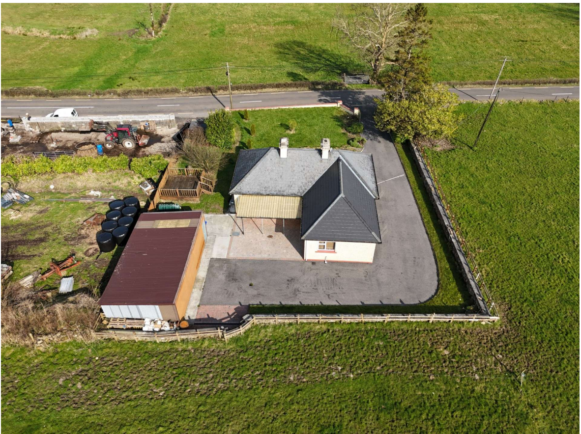
Mullaghroe, Gurteen, Co. Sligo. F56 KC99