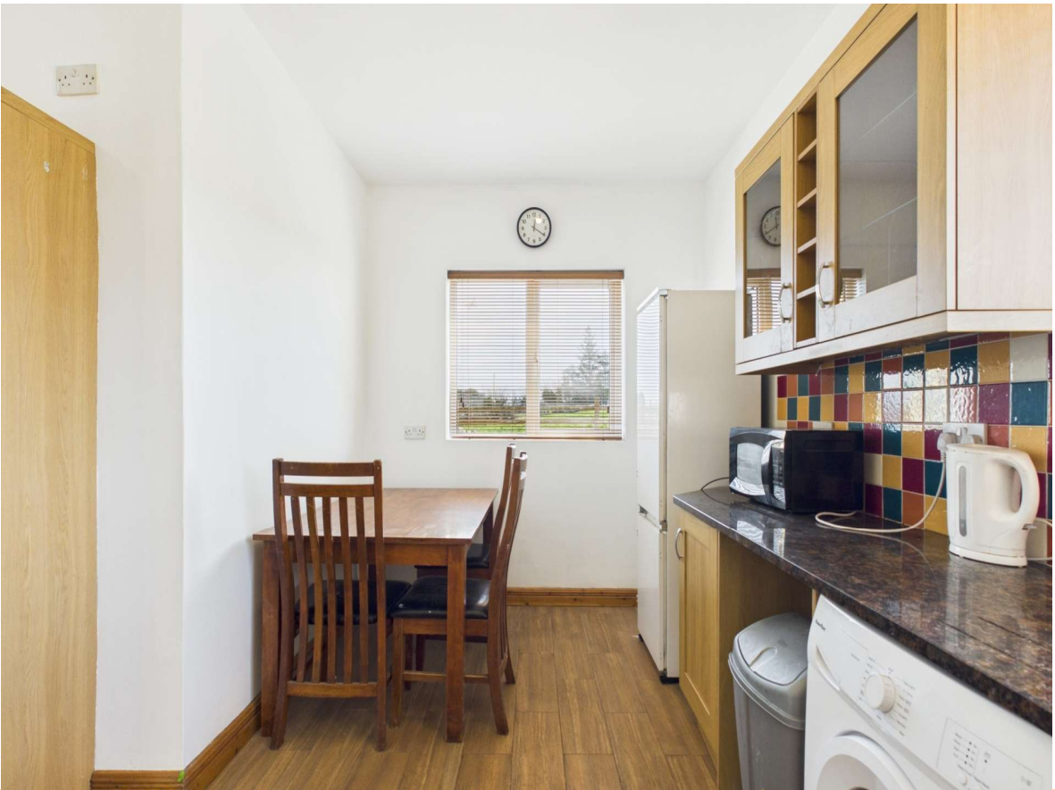
Mullaghroe, Gurteen, Co. Sligo. F56 KC99