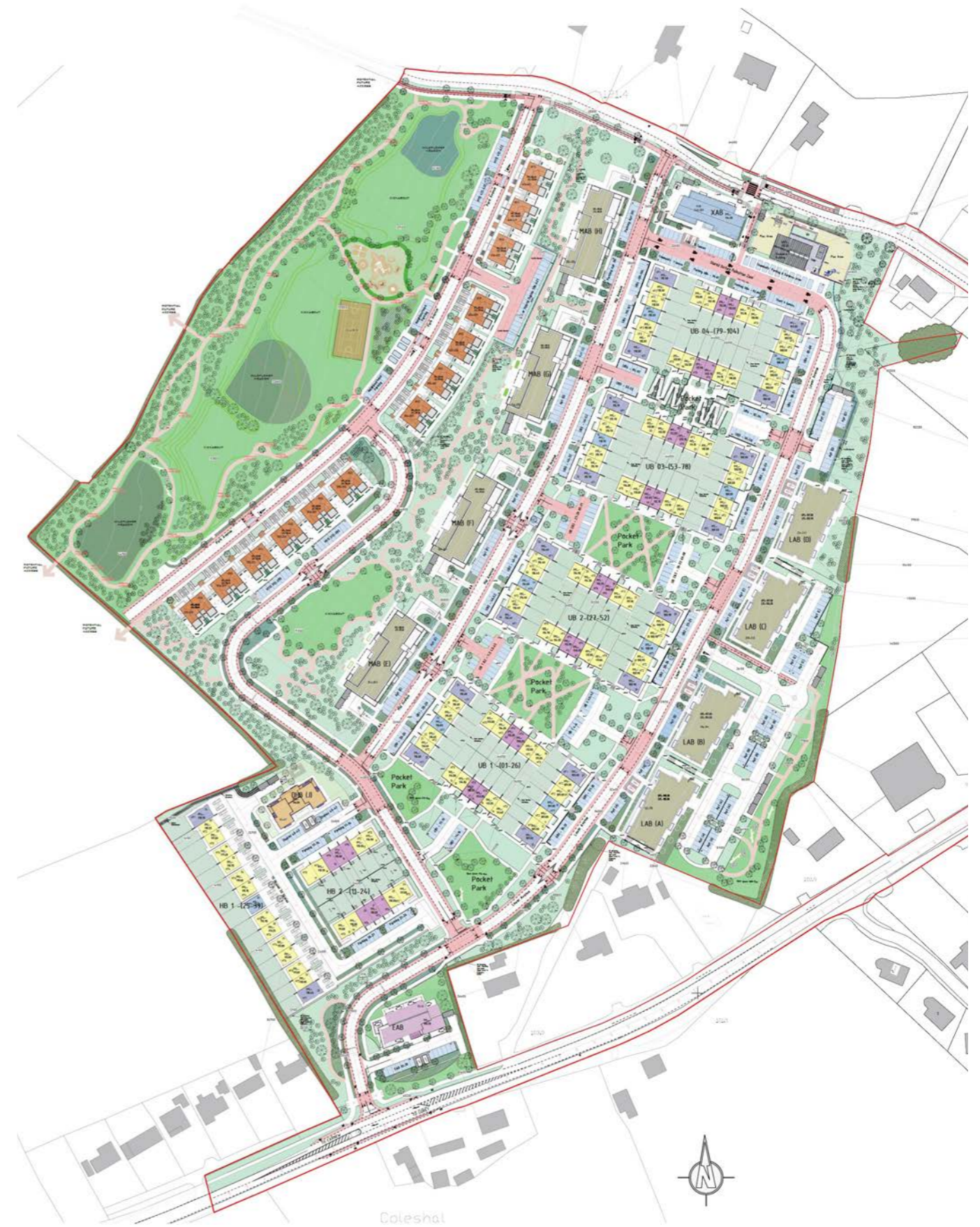
SHD Site Plan