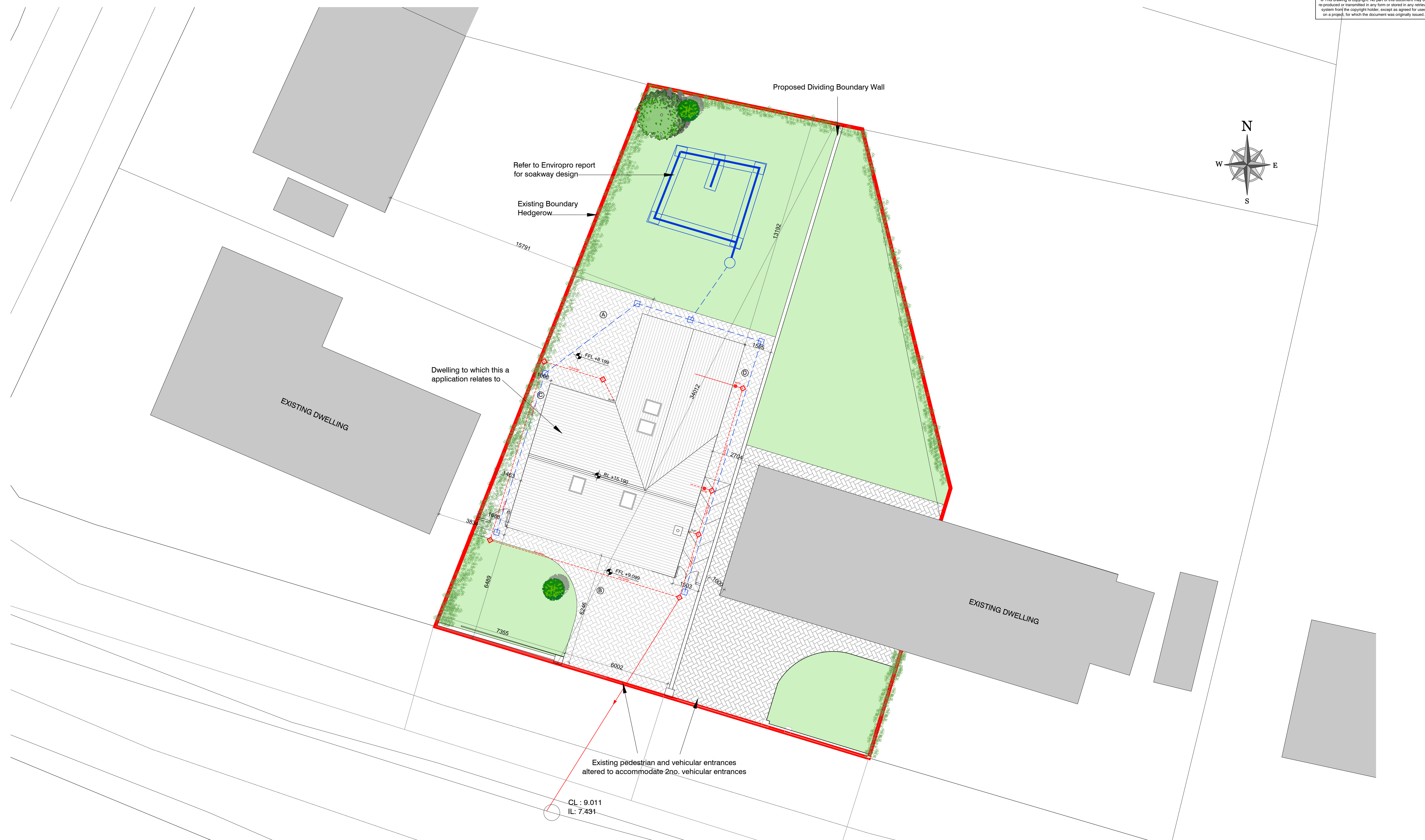
PROPOSED SITE LAYOUT PLAN SCALE 1:100