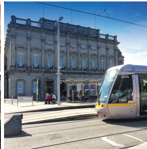
▲ Artists' Impression