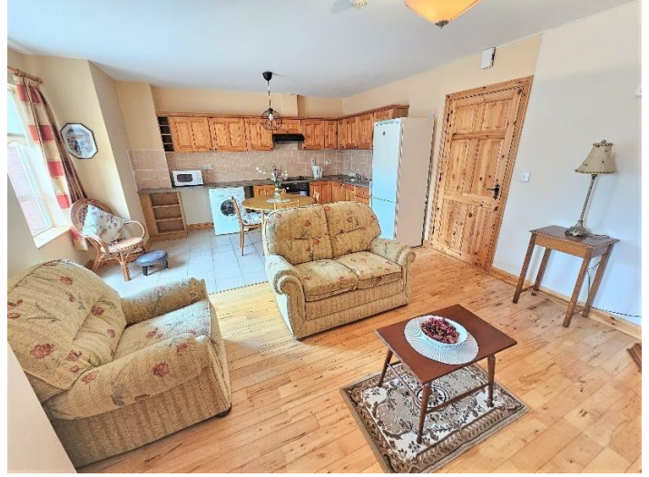
Living / Kitchen / Dining Room