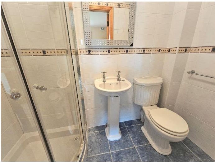
Shower Room Ensuite