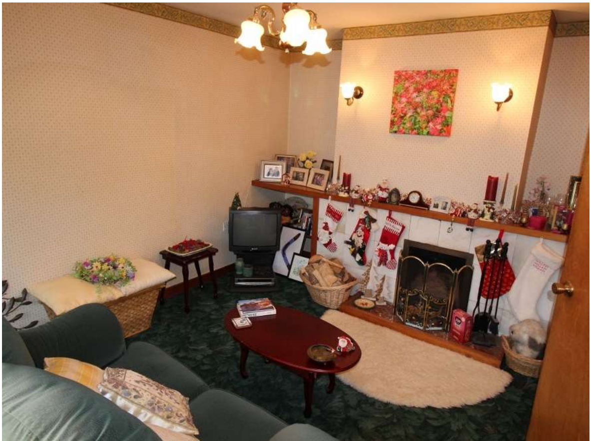
Alberta, Knockroe, Castlereagh, F45 Y153