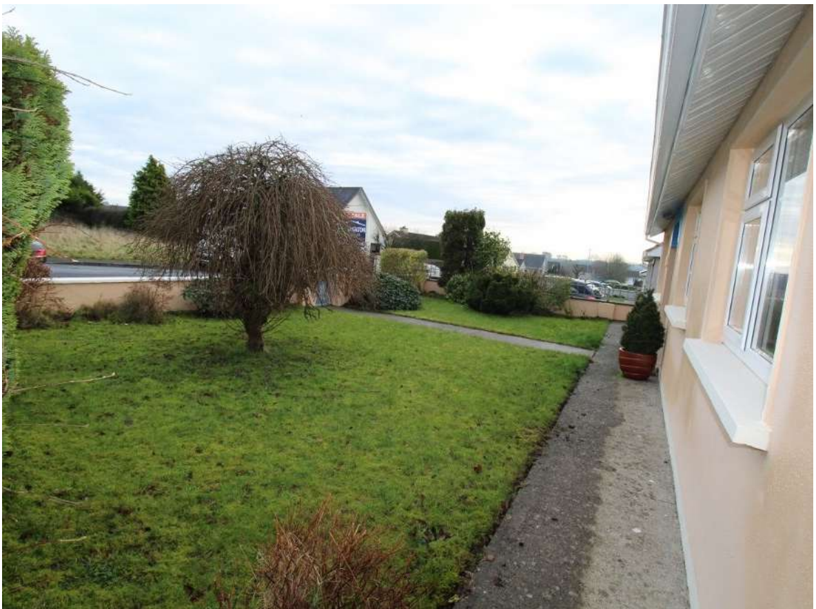
Alberta, Knockroe, Castlerea, F45 Y153