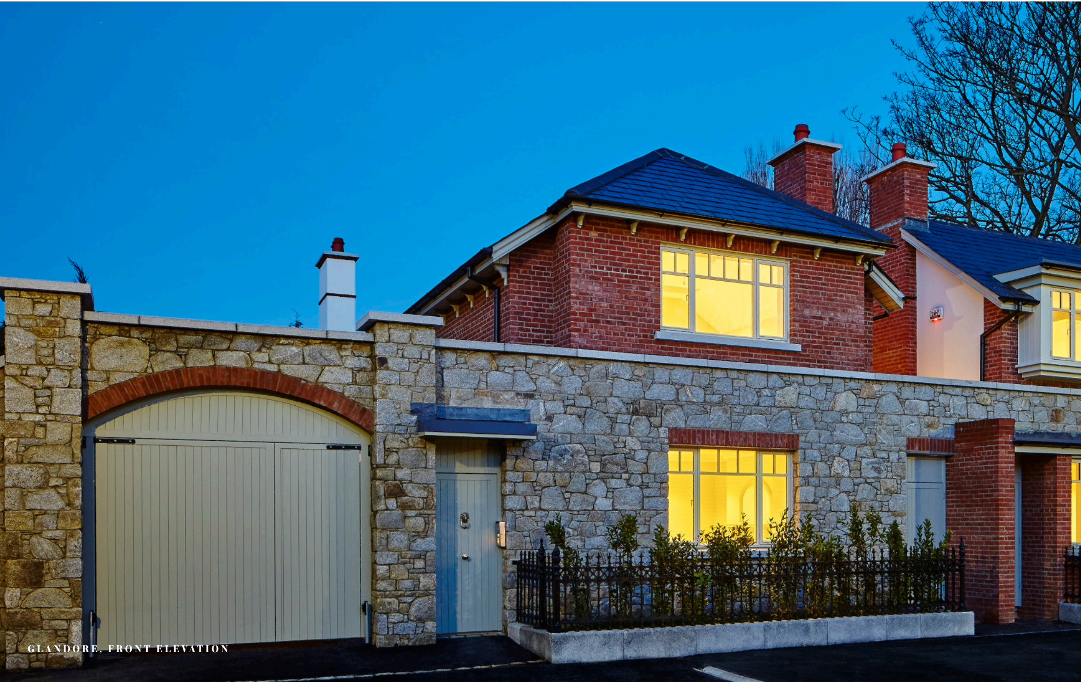
GLANDORE, FRONT ELEVATION

A wonderfully detailed residence that blends sustainability with luxury, Glandore will appeal to environmentally-aware homeowners who also understand quality.