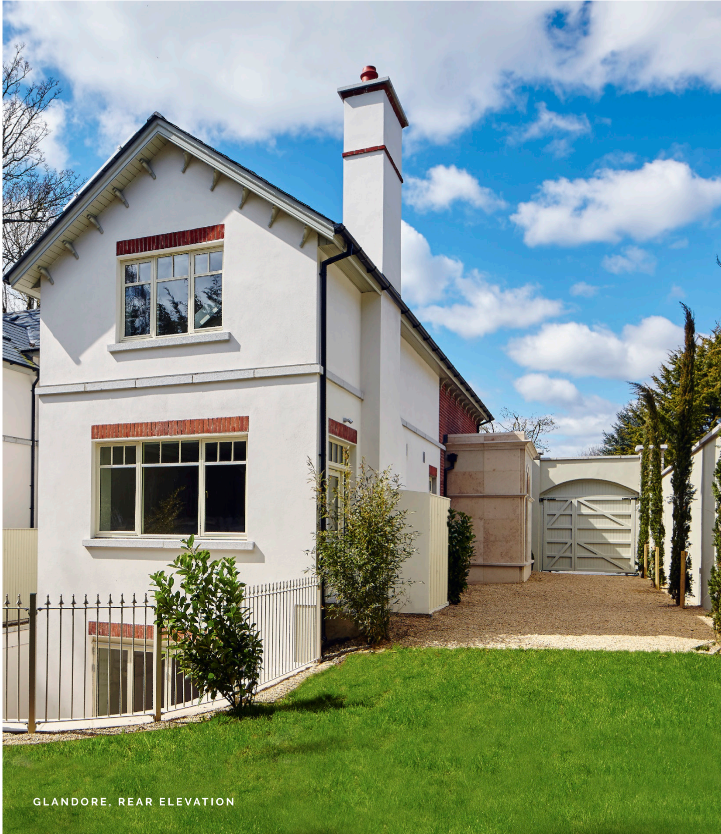
GLANDORE, REAR ELEVATION