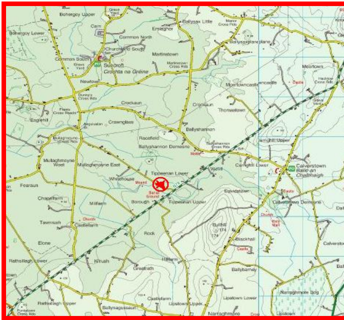
Location of lands in red