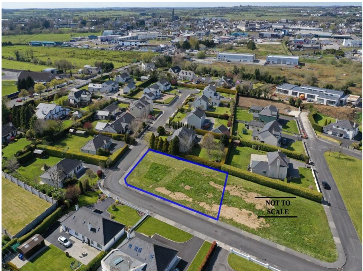
Site No.14, Ard Aoibhinn, Ardsallagh More, Roscommon Town