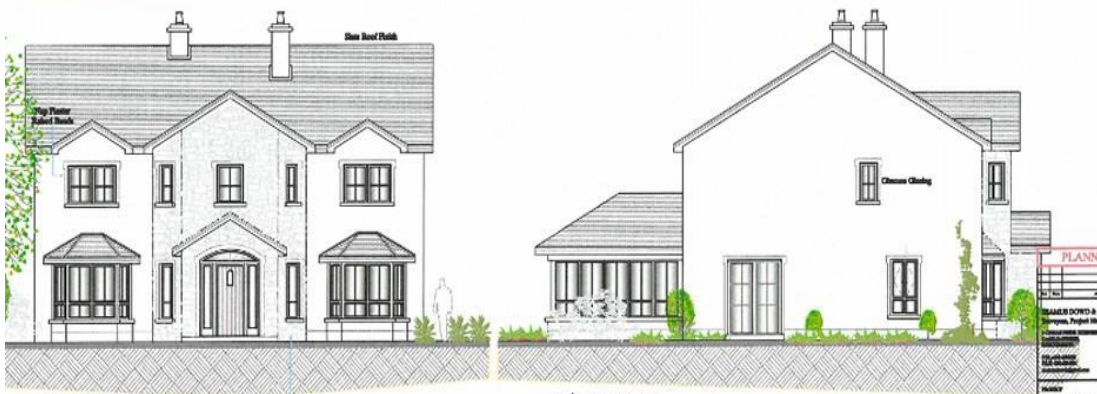
F FRONT ELEVATION Scale 1:100