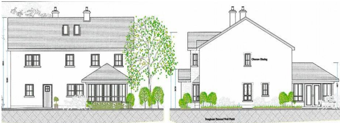
R REAR ELEVATION Scale 1:100