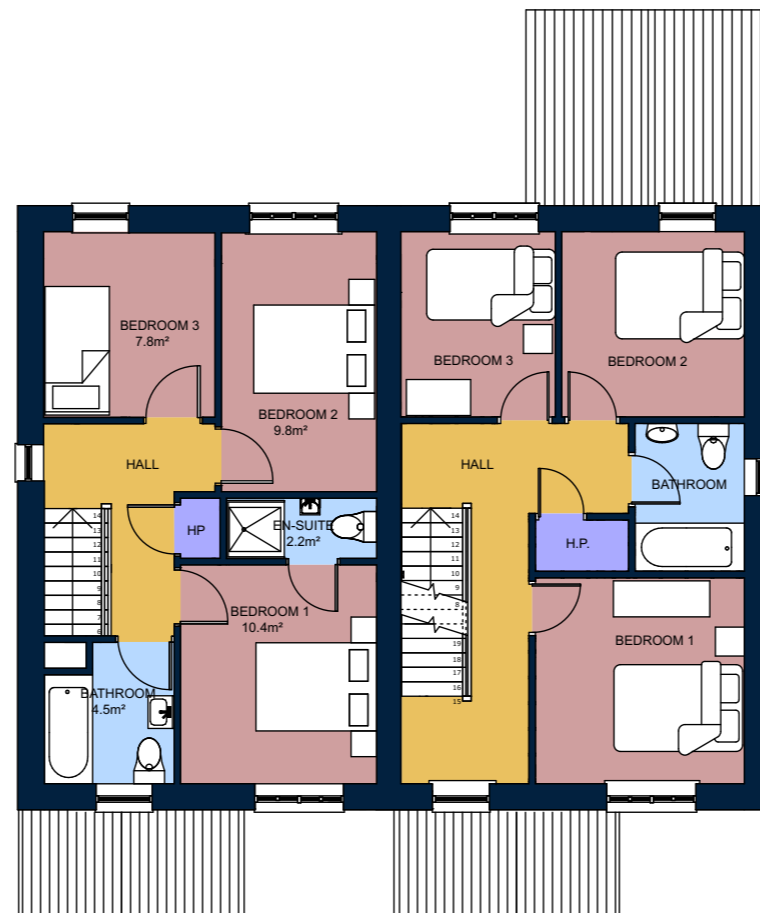
HOUSE TYPE E FIRST FLOOR