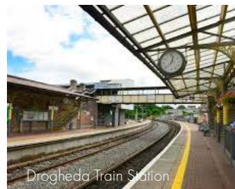
Drogheda Train Station