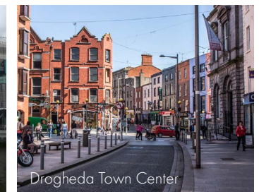
Drogheda Town Center