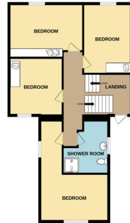
FLOOR 3 806 sq.ft. (74.9 sq.m.) approx.