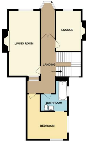
FLOOR 2 806 sq.ft. (74.9 sq.m.) approx.