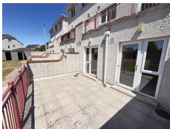
Patio area to rear, with doors from each bedroom.

Kindly note that any negotiations respecting the above property are conducted through us. We do not hold ourselves responsible in any way for inaccuracy, but will take every care in preparing particulars. All offers are subject to the property being unsold, let or withdrawn. The above may be seen by appointment only. Any reasonable offer will be submitted to the owner for consideration. If the property does not interest you, kindly advise us as to your exact requirements.