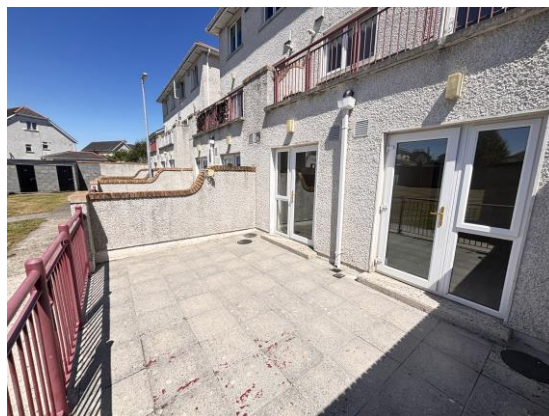
Patio area to rear, with doors from each bedroom.

Kindly note that any negotiations respecting the above property are conducted through us. We do not hold ourselves responsible in any way for inaccuracy, but will take every care in preparing particulars. All offers are subject to the property being unsold, let or withdrawn. The above may be seen by appointment only. Any reasonable offer will be submitted to the owner for consideration. If the property does not interest you, kindly advise us as to your exact requirements.