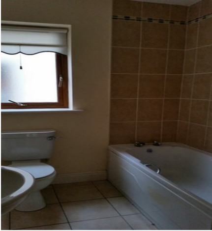
Bathroom: 6'1 x 9'