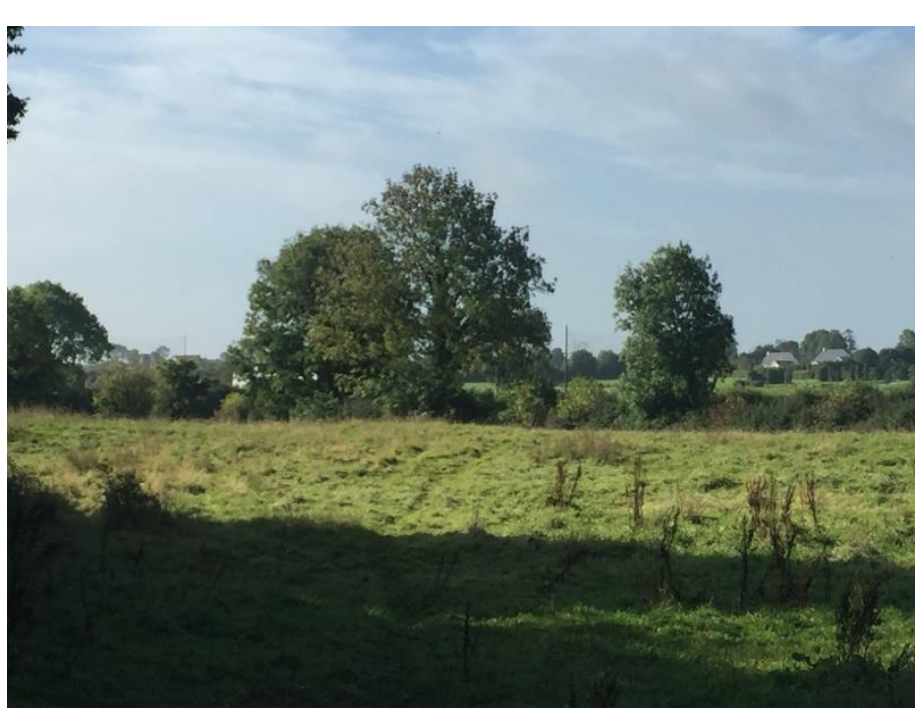
c. 2.1 ACRE SITE S.P.P

Lovely 2.1 acre site being sold subject to planning. Prime location, between the Waterford & the Kells Road, first right past the rugby club and Foulkstown church. Sign post up!