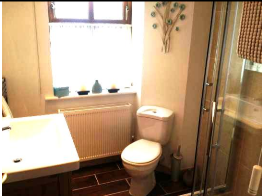
Bathroom / En-Suite