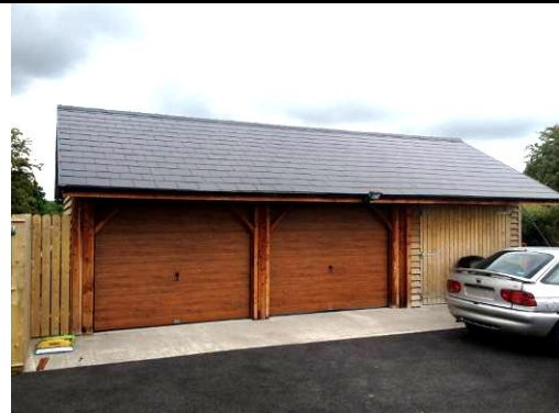
Garage to Side