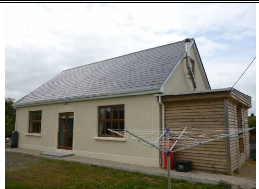
Rear View of Cottage