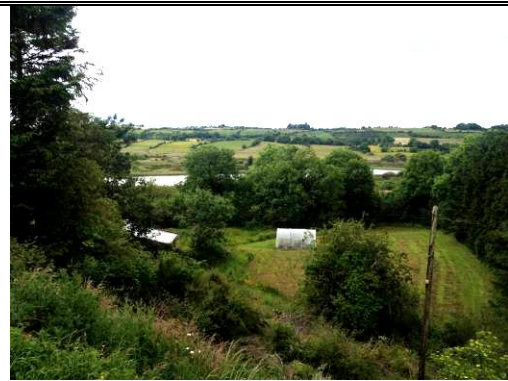
View of rear of cottage (over looking lands)