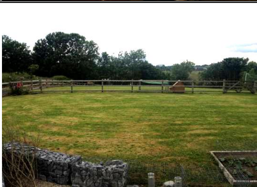
Garden to Side