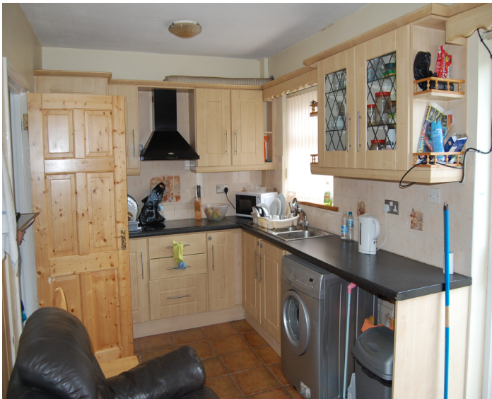
KITCHEN CUM DINING AREA

Three bed end of terrace property in need of upgrading. Accommodation comprises: Entrance hall, living room, kitchen cum dining room, 3 bedrooms and family bathroom. Concrete shed. Gas central heating, double glazed windows, off street parking to front and enclosed yard to rear. Total floor area: 80.24 sq.m / 863.70 sq.ft