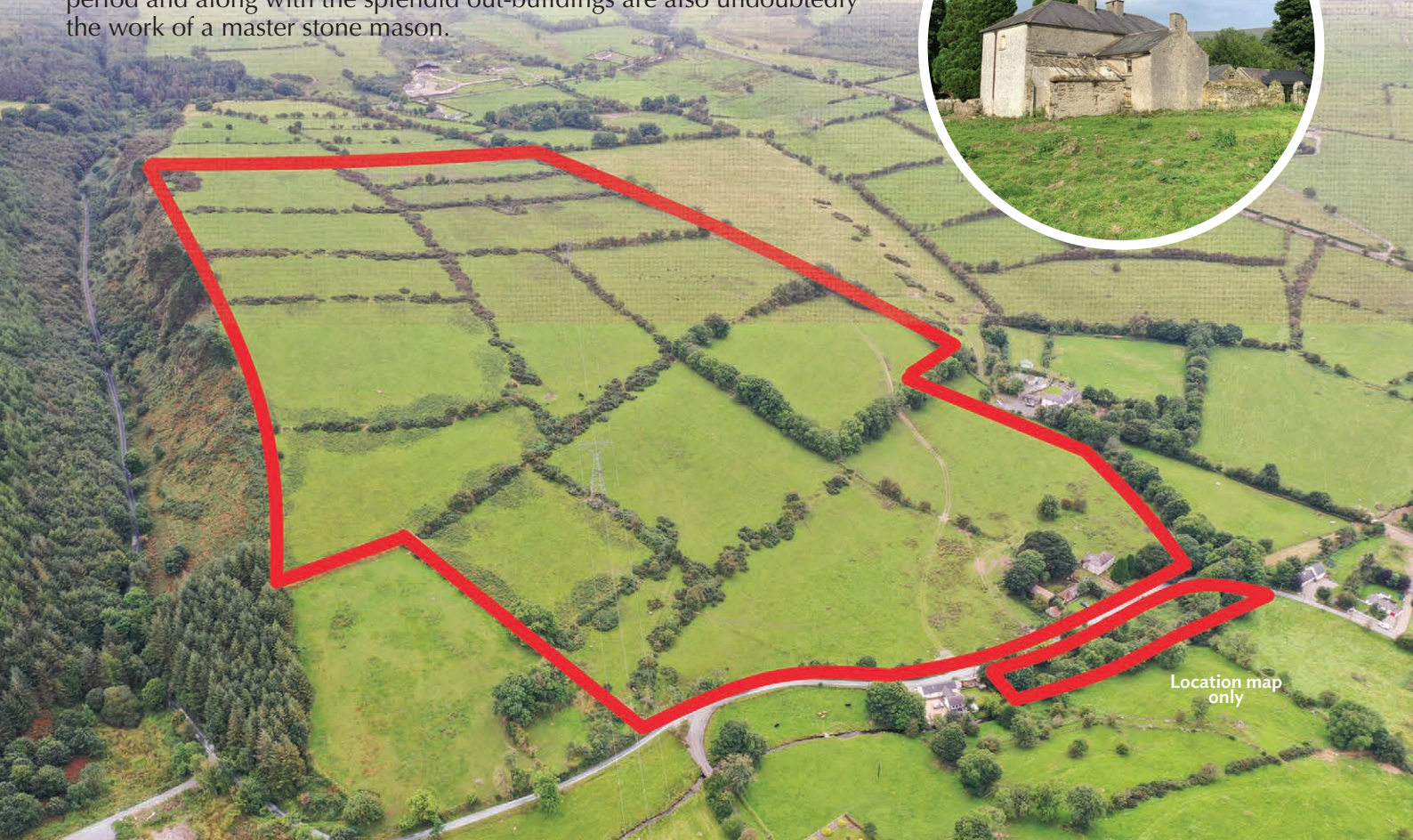
Location map only