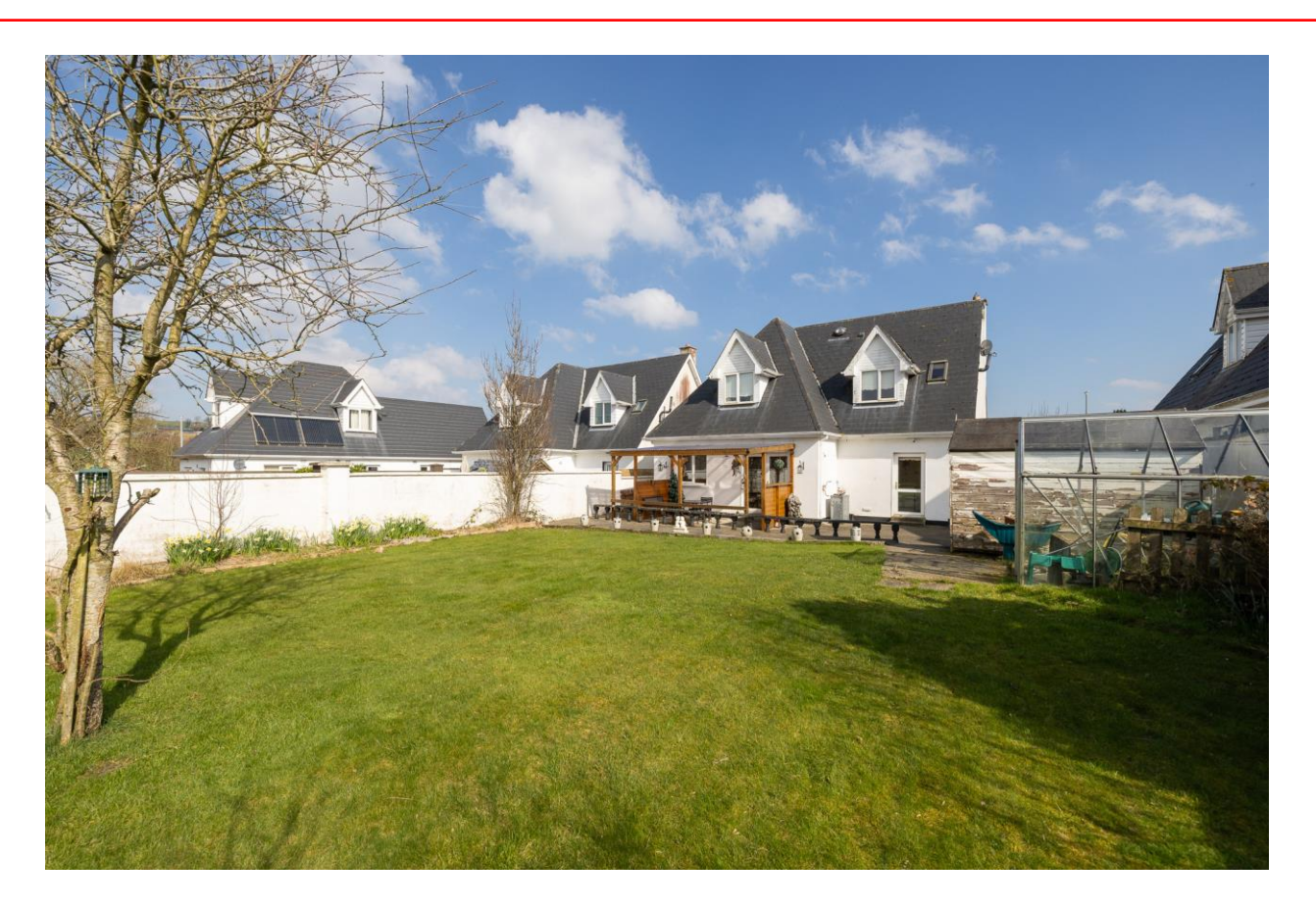
Directions Y14 NA46