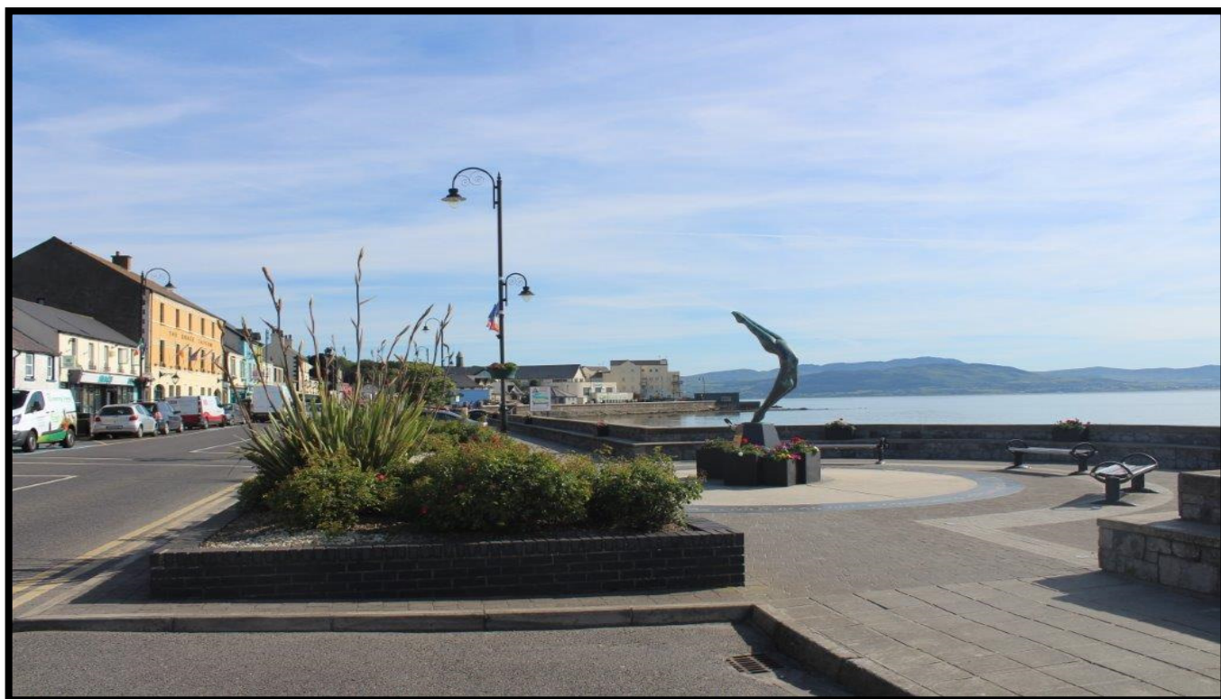
PICTURE OF PORTION OF BUILDINGS TO FRONT OF SITE ON OLD GOLF LINKS ROAD, BLACKROCK, CO. LOUTH