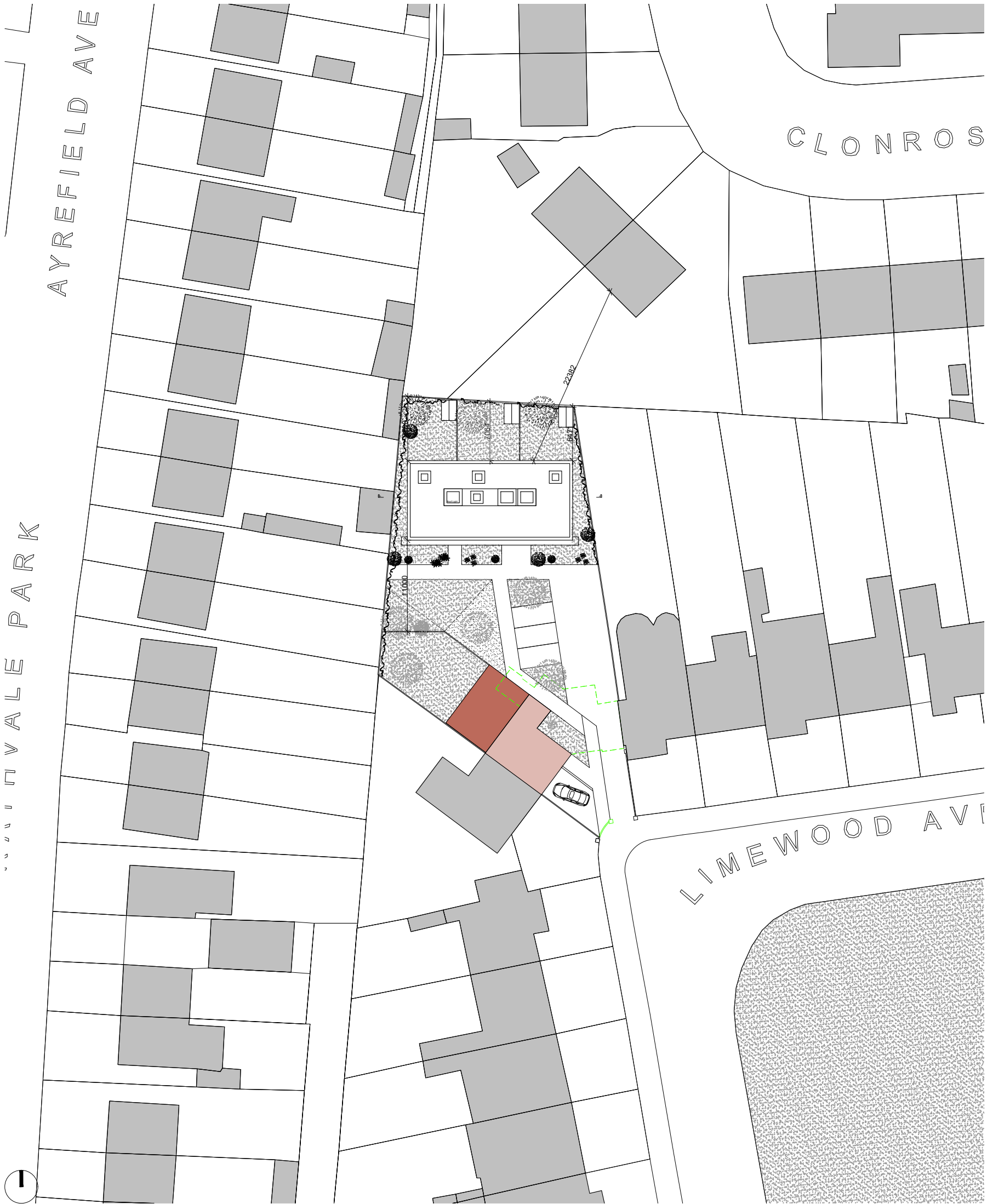
Proposed Site + Roof Plan 1:500