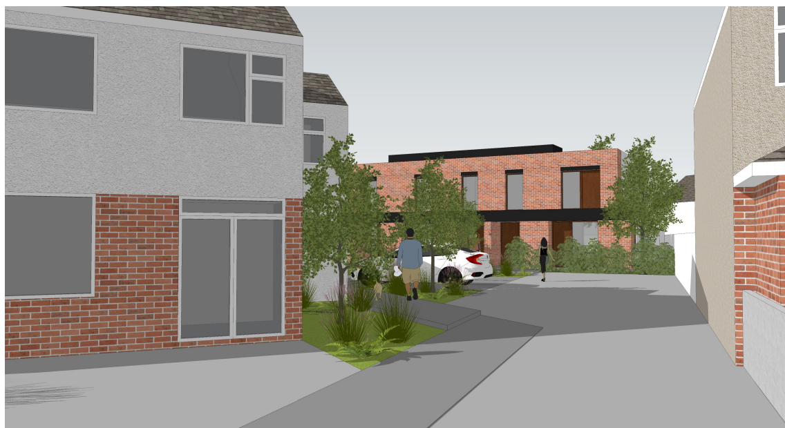
Proposed Model View 3 From driveway