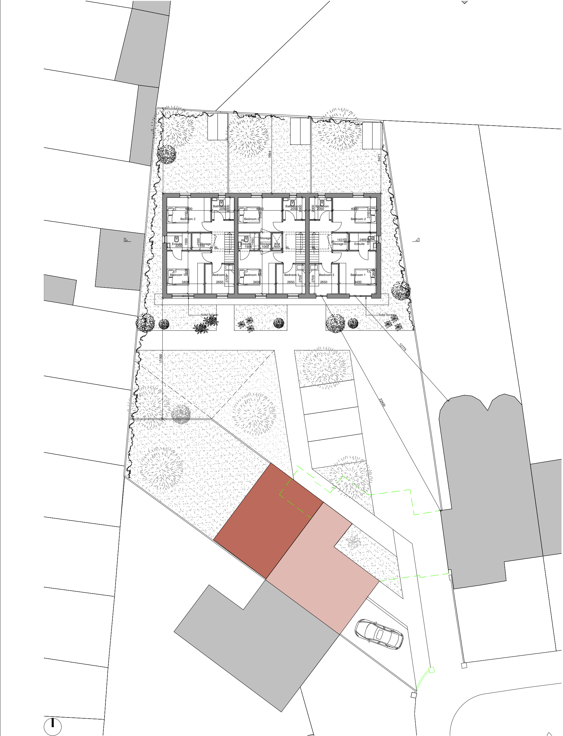
Proposed First Floor Plan 1:200