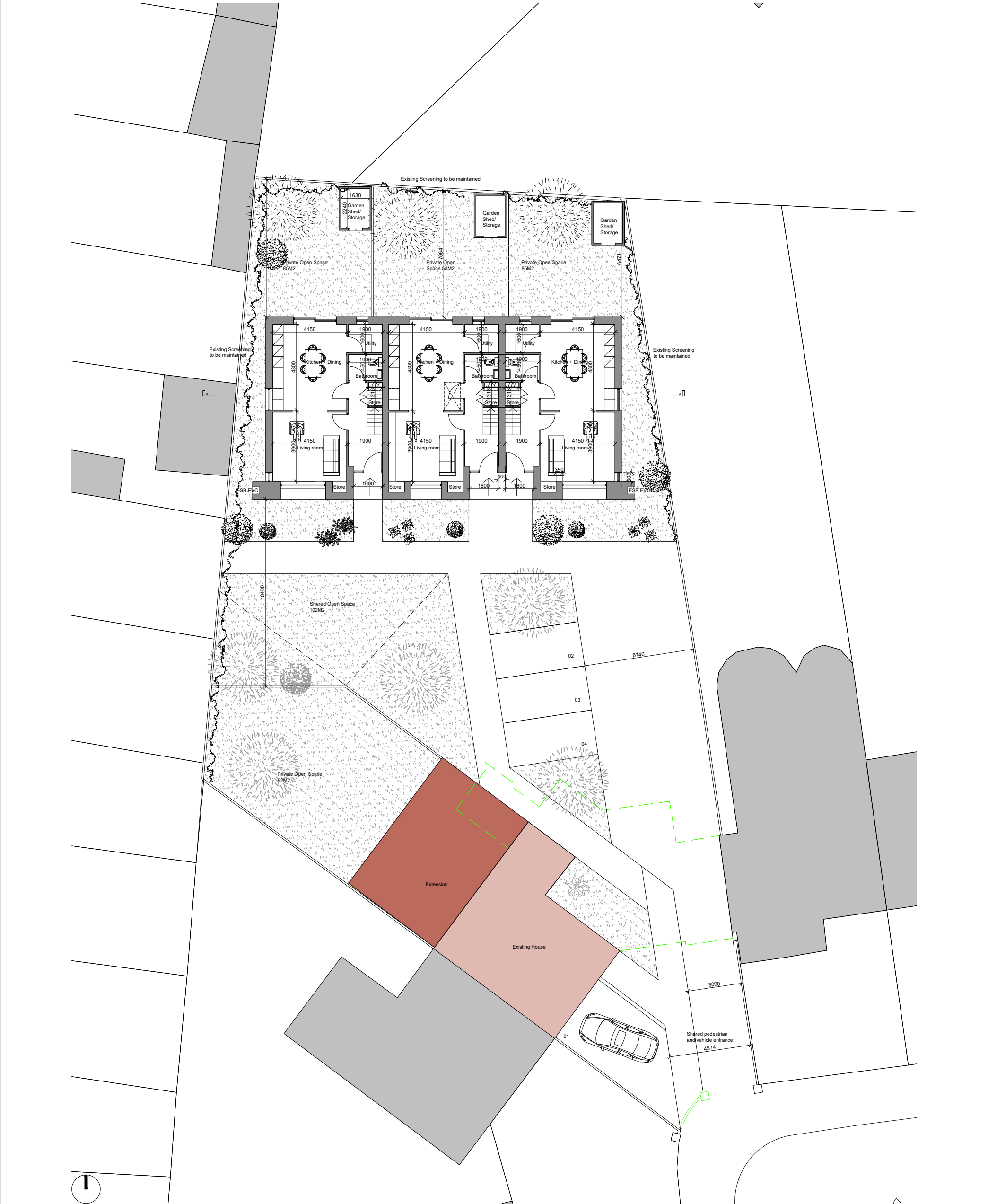
Proposed Ground Floor Plan 1:200