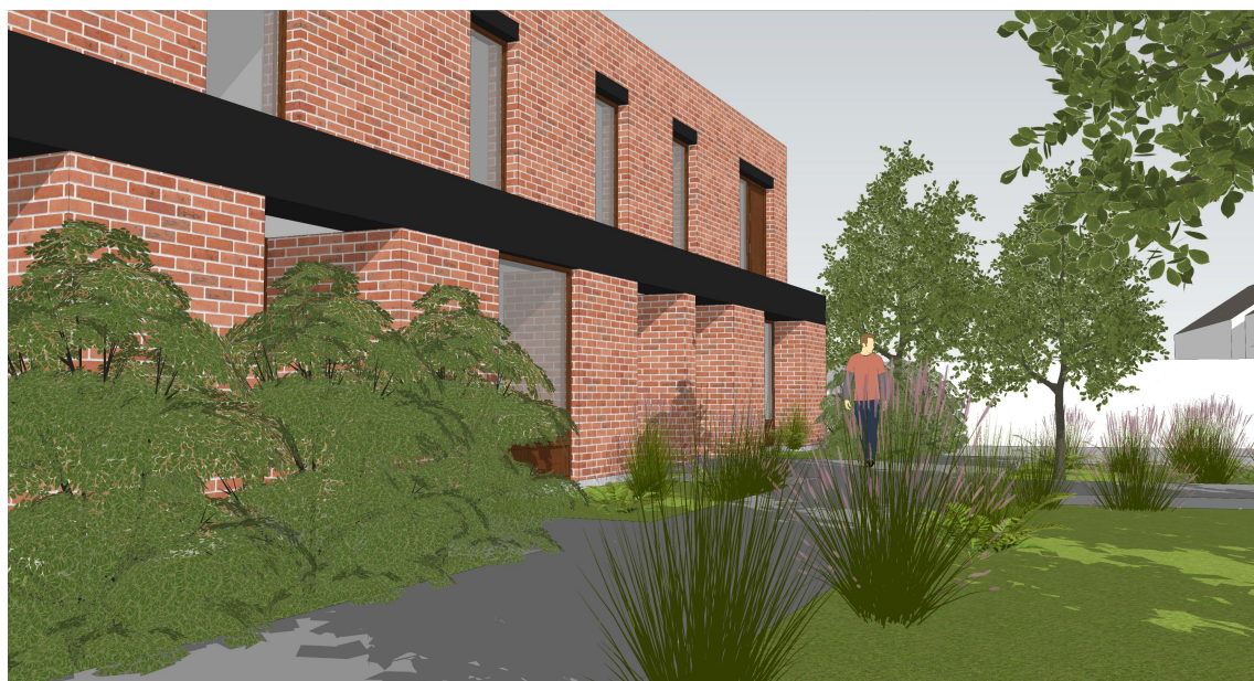
Proposed Model View 4 From shared green space