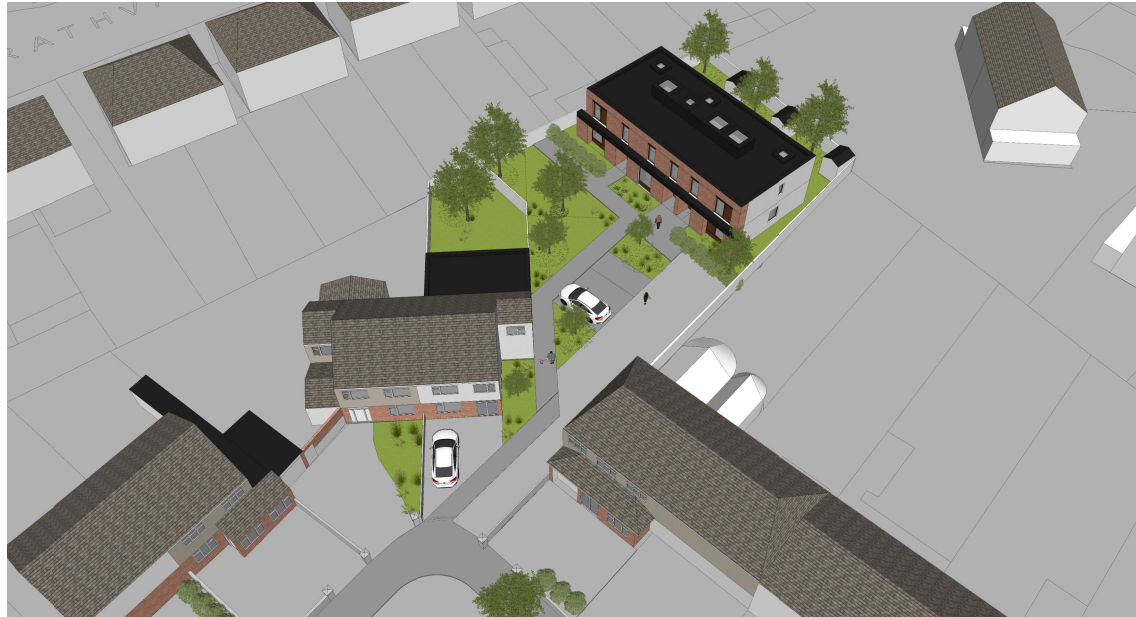
Proposed Model View 1 Axonometric