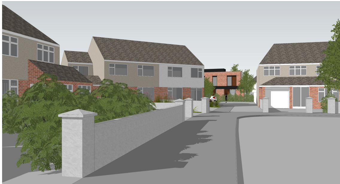
Proposed Model View 2 From road