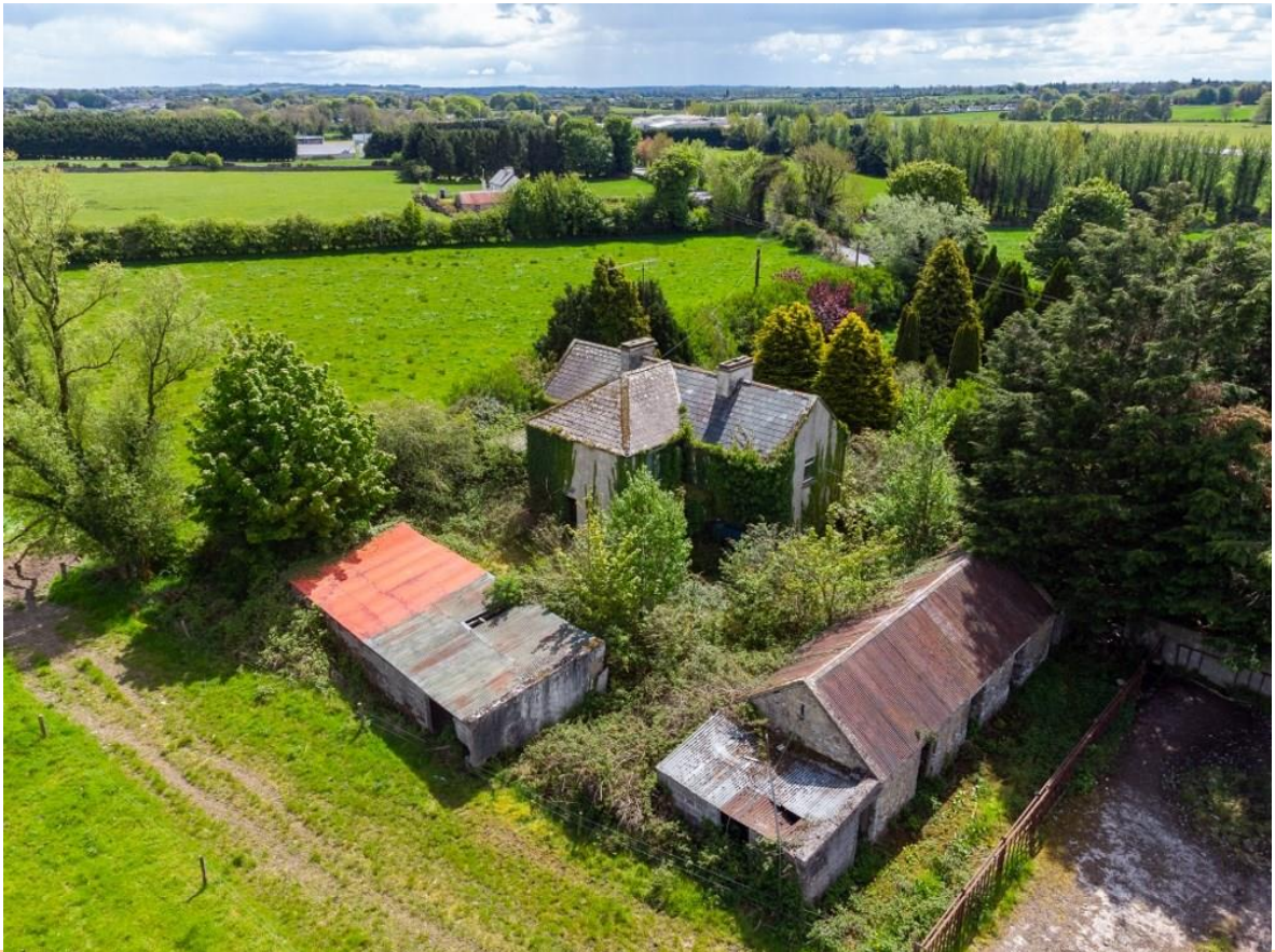
Lot 1: Residence And Outbuildings On C. 1 Acres, Bellanacarrow, Athleague, F42 E060