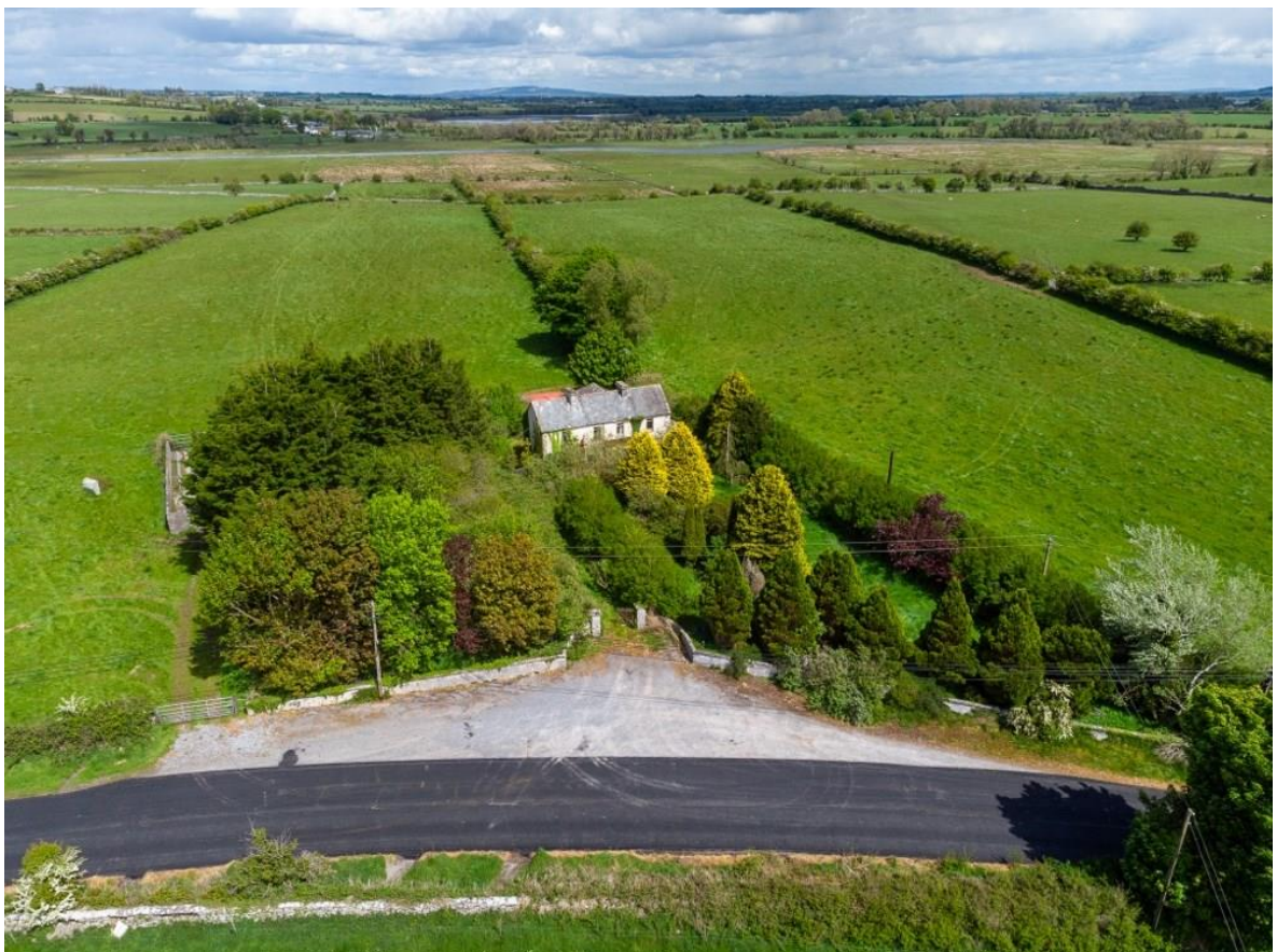
Lot 1: Residence And Outbuildings On C. 1 Acres, Bellanacarrow, Athleague, F42 E060