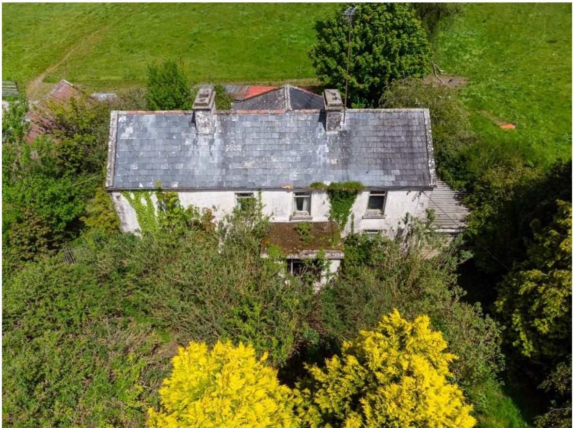
Lot 1: Residence And Outbuildings On C. 1 Acres, Bellanacarrow, Athleague, F42 E060