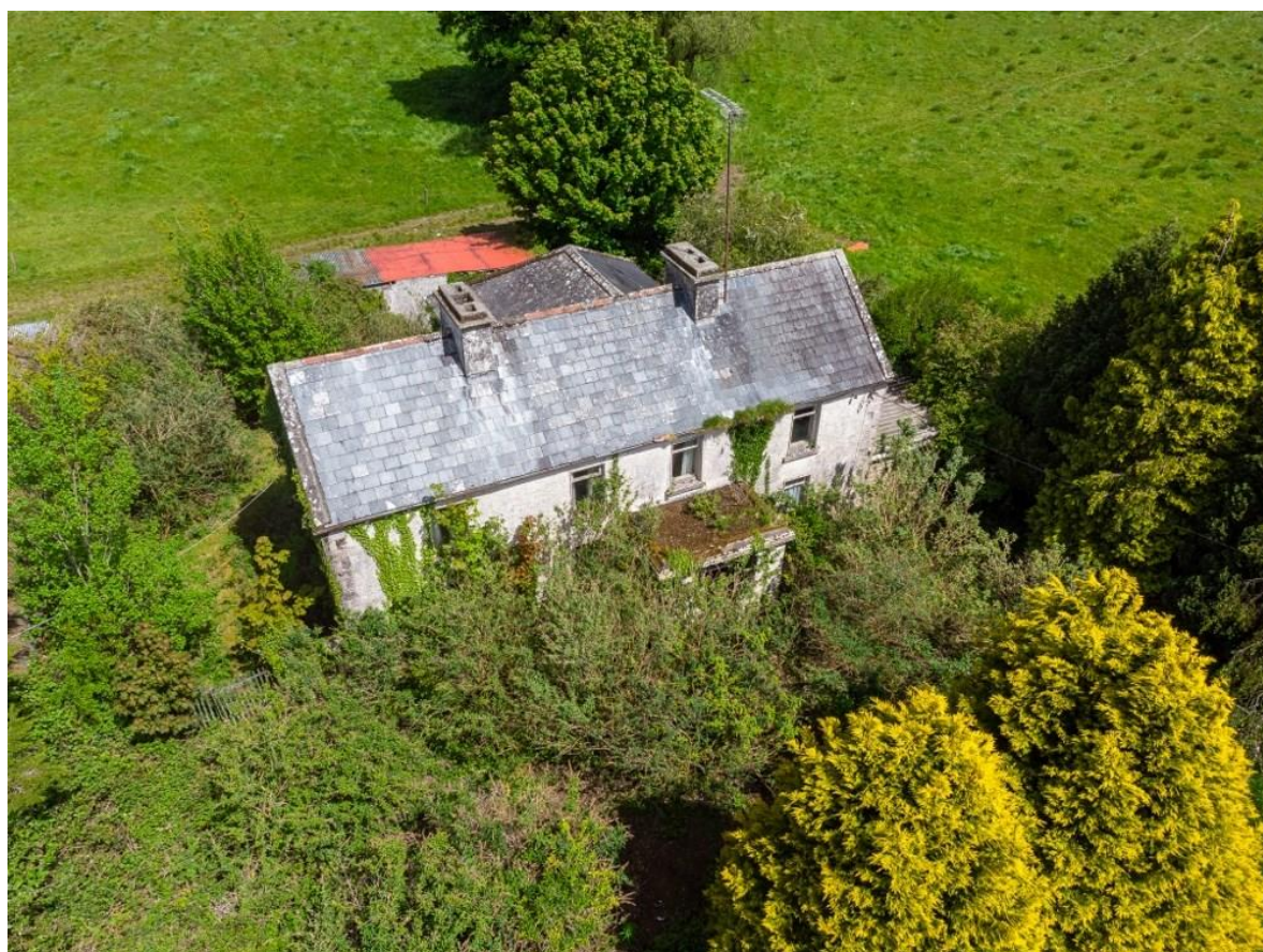
Lot 1: Residence And Outbuildings On C. 1 Acres, Bellanacarrow, Athleague, F42 E060