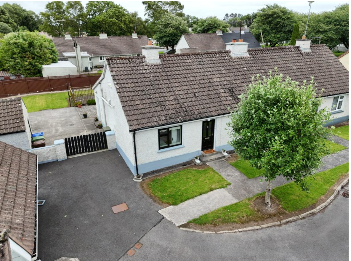
49 Cloontuskert, Lanesborough, Co. Roscommon. N39 C920