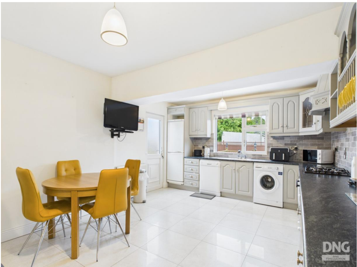
49 Cloontuskert, Lanesborough, Co. Roscommon. N39 C920