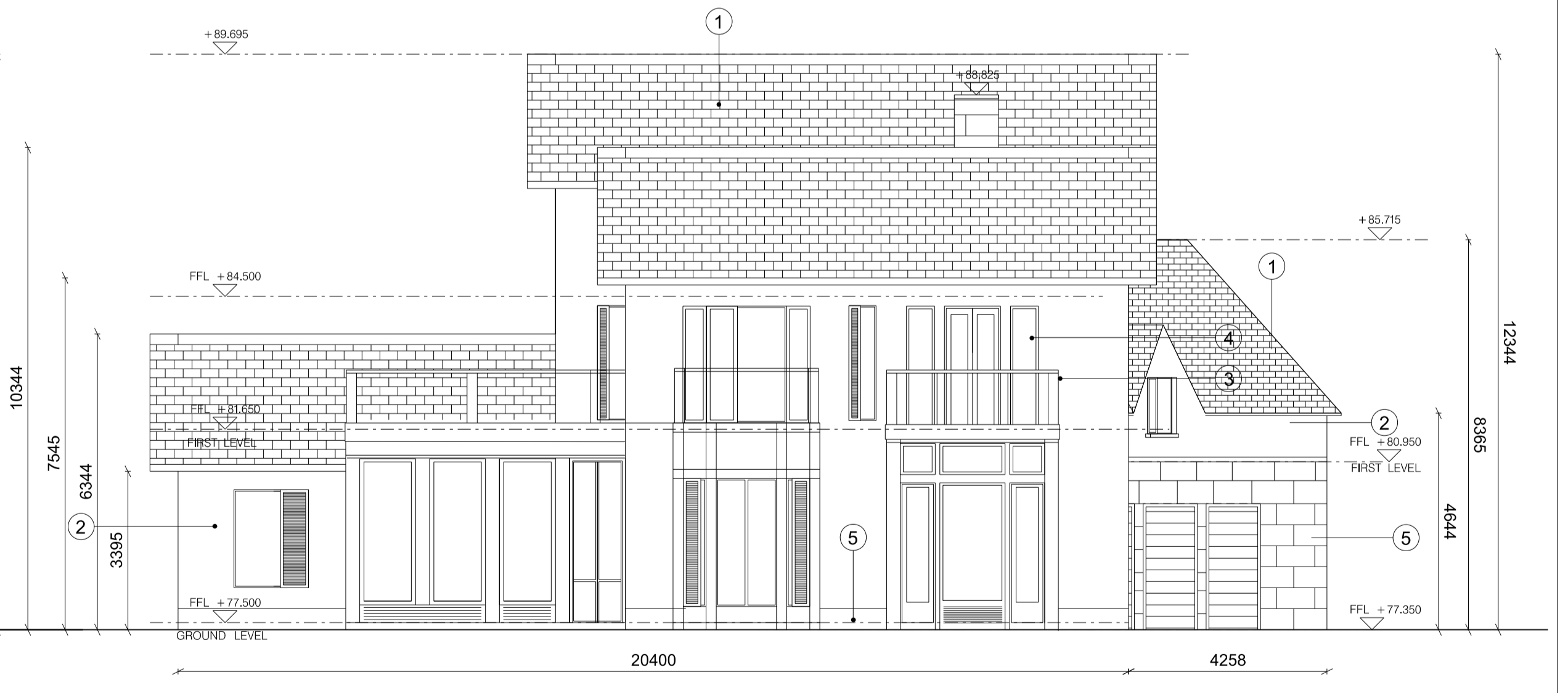
1 ELEVATION E4 1:100