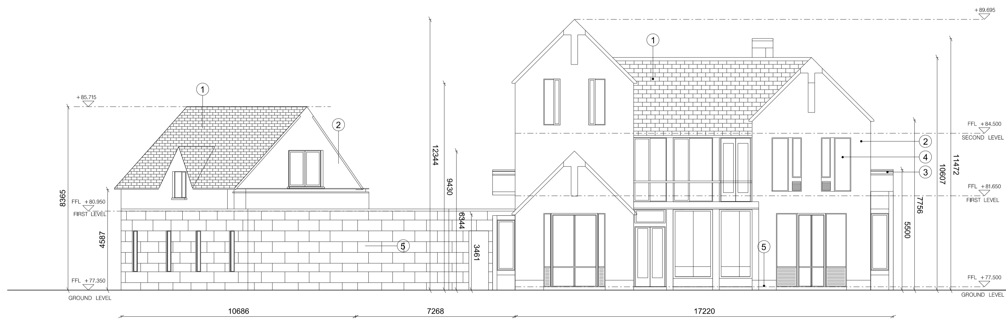
1 ELEVATION E3 1:100