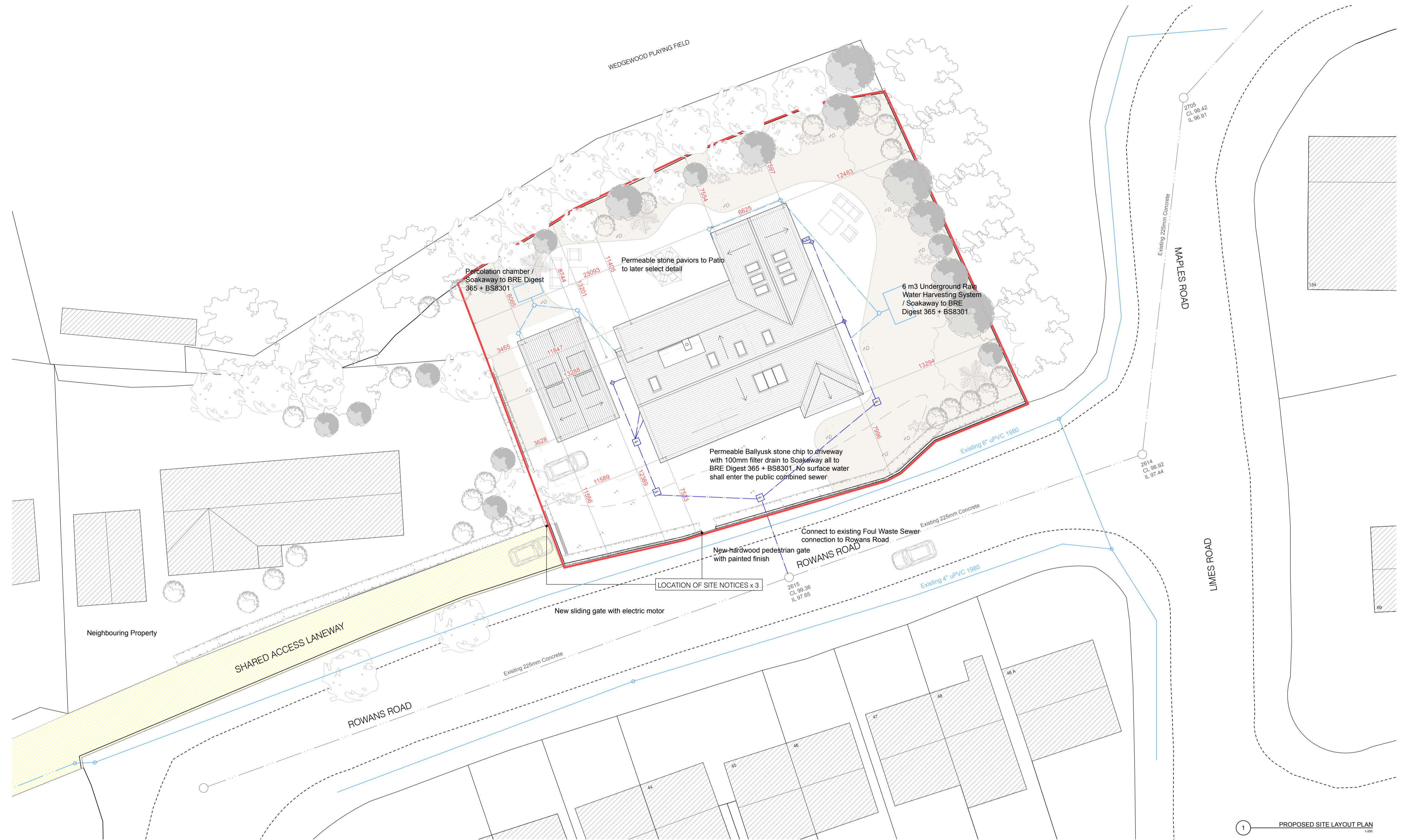
1 PROPOSED SITE LAYOUT PLAN NORTH