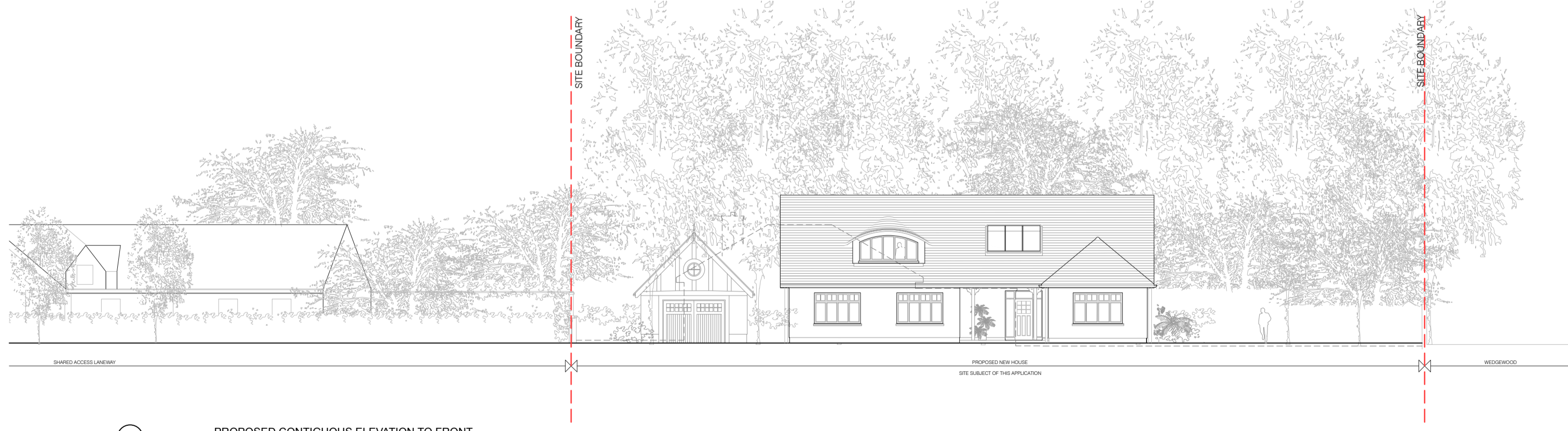
3 PROPOSED CONTIGUOUS ELEVATION TO FRONT