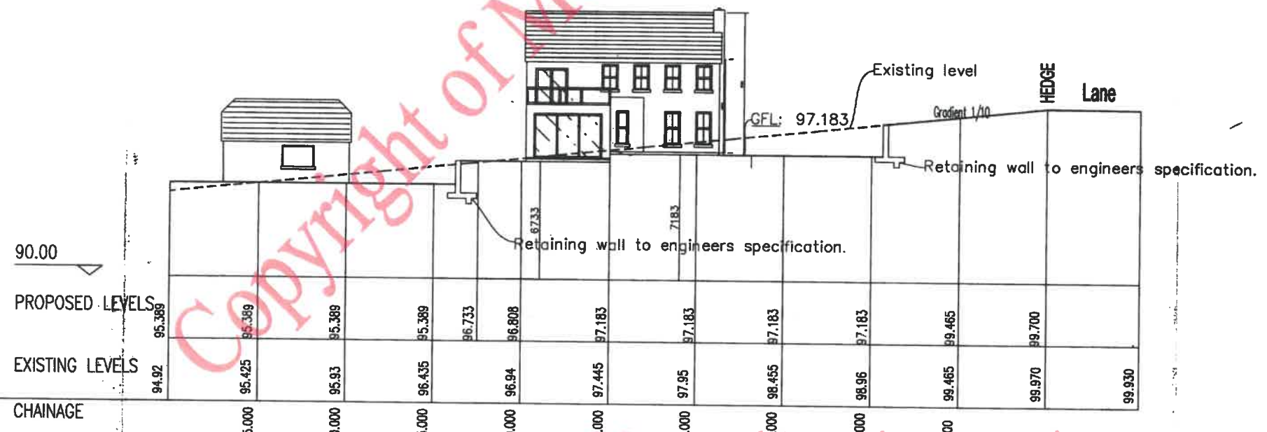
SECTION A-A Scale 1:250

MONAGHAN CO. COUNCIL REF. NO. 15/128 PLANNING DEPARTMENT