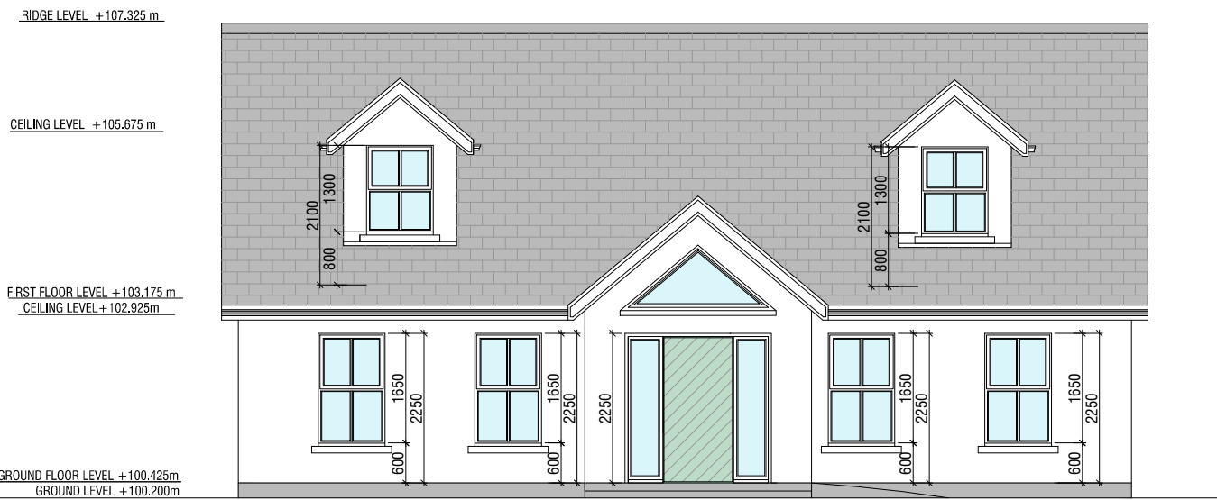
Front Elevation Scale 1-100