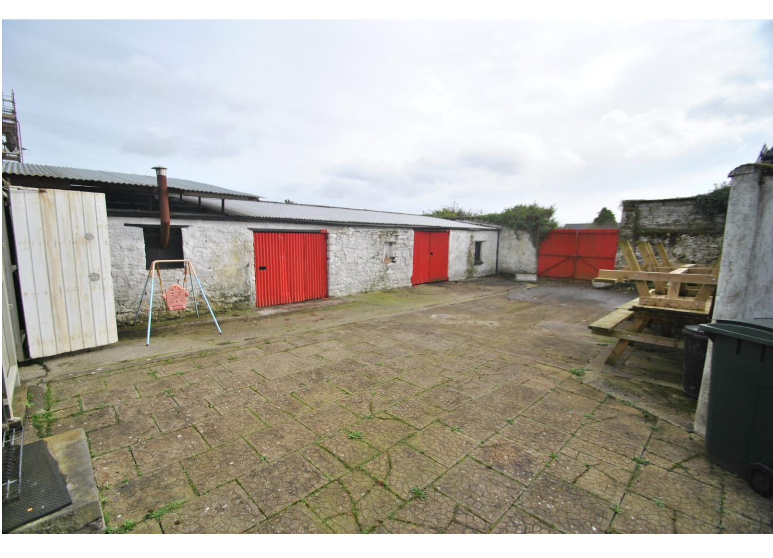
Directions Main St., Borris in Ossory. Eircode R32 R8PY.