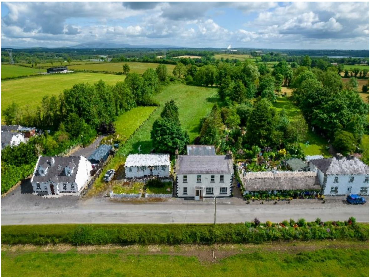
Kilmore Village, Carrick-On-Shannon, N41 YN79