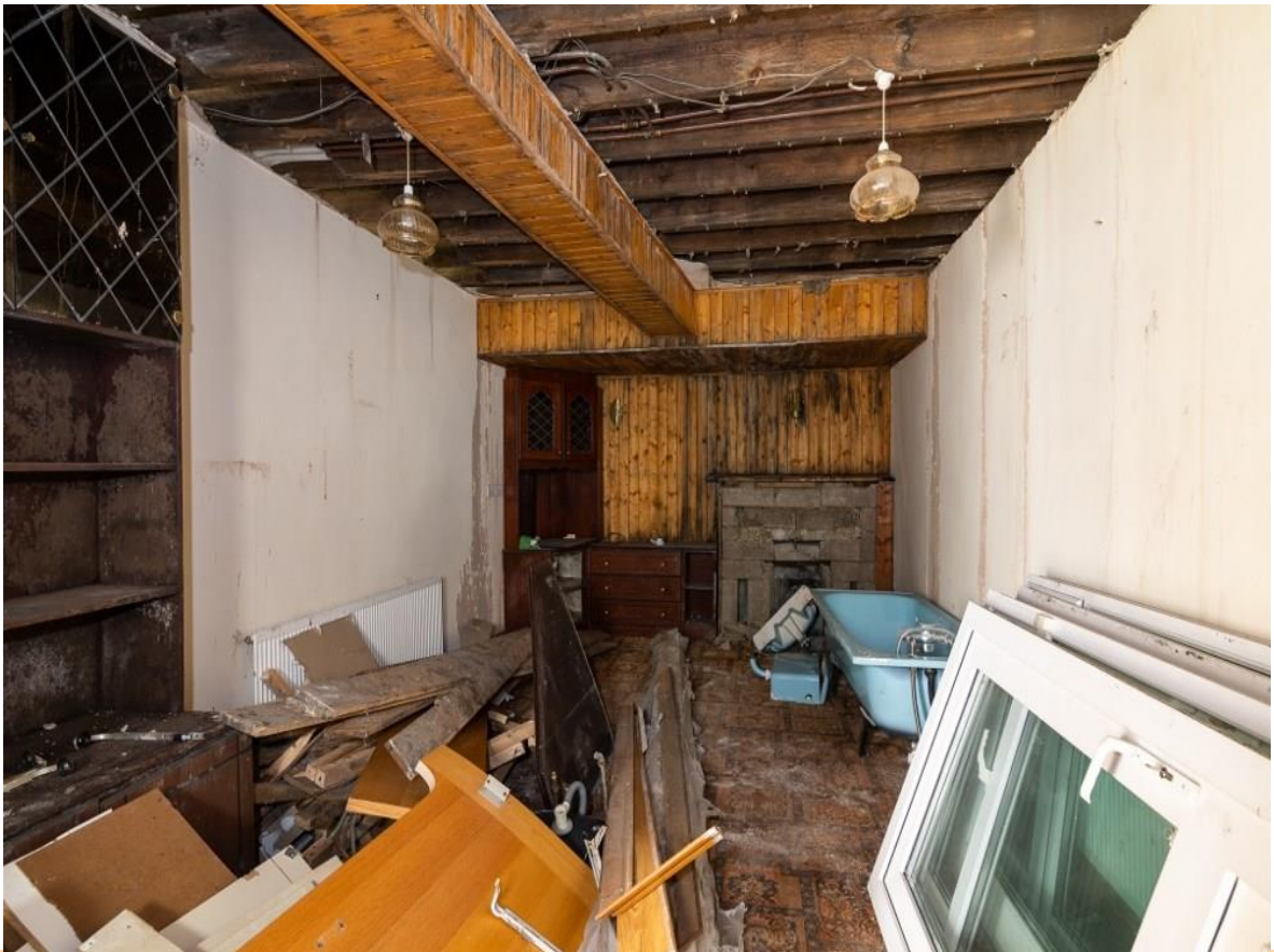
Kilmore Village, Carrick-On-Shannon, N41 YN79