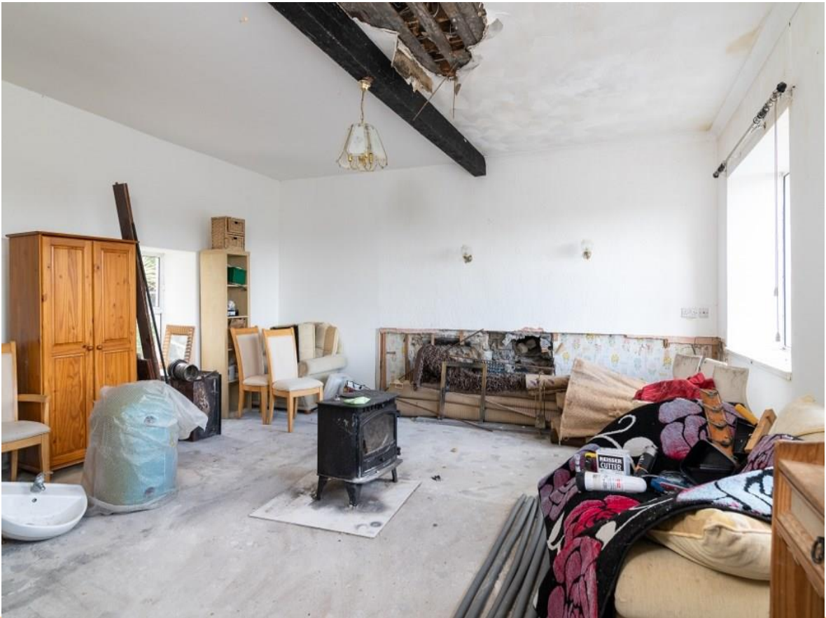
Kilmore Village, Carrick-On-Shannon, N41 YN79