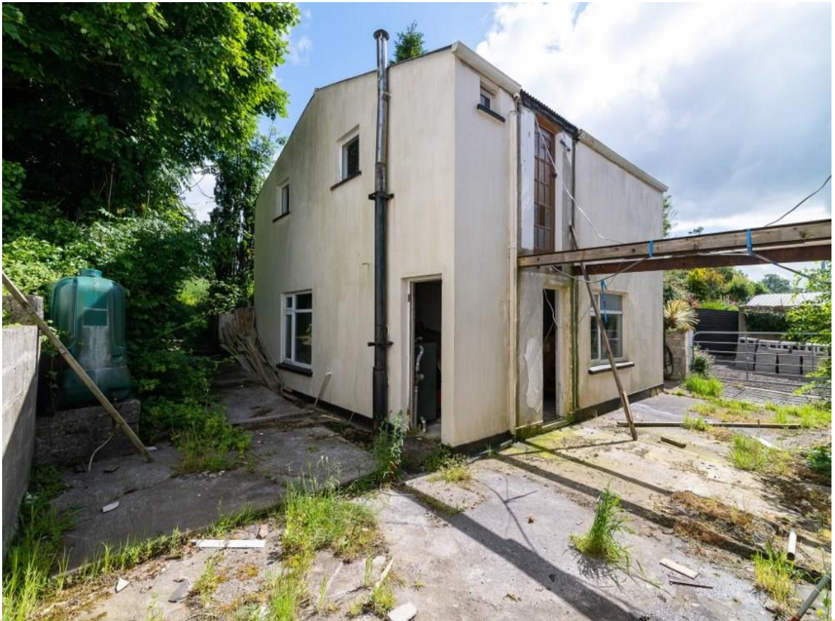
Kilmore Village, Carrick-On-Shannon, N41 YN79