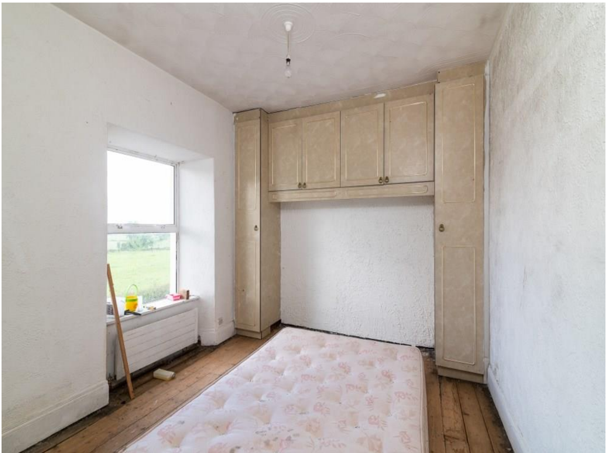
Kilmore Village, Carrick-On-Shannon, N41 YN79