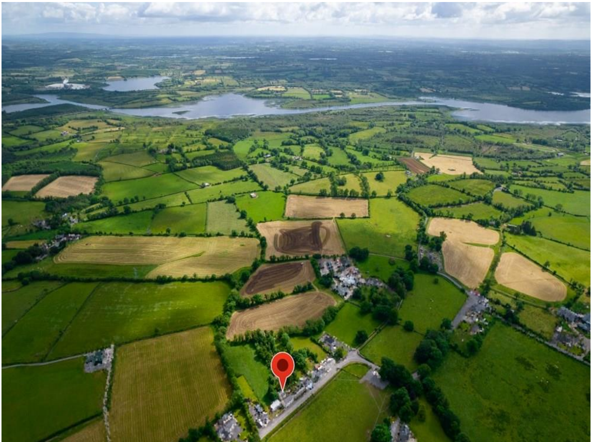
Kilmore Village, Carrick-On-Shannon, N41 YN79