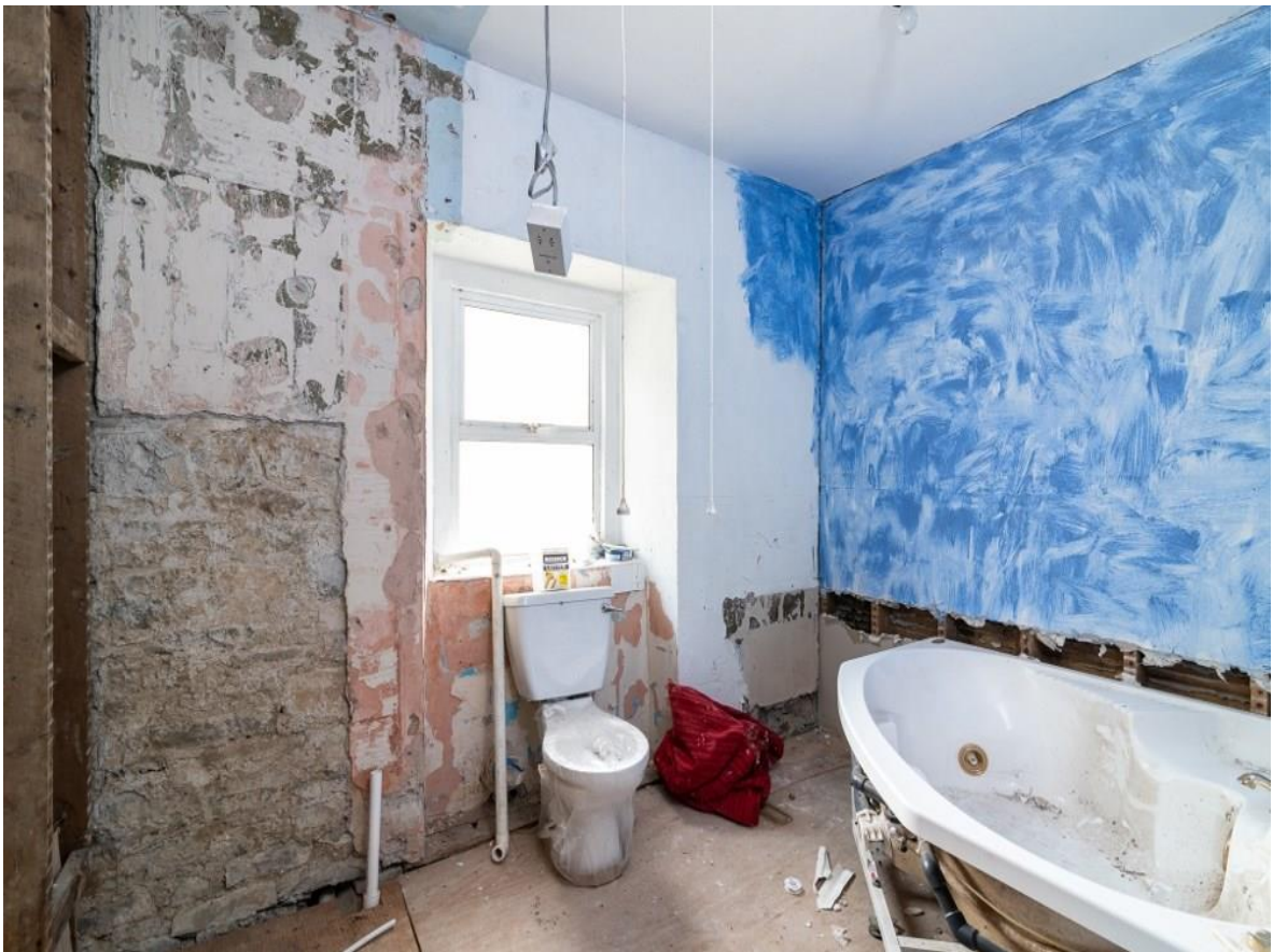
Kilmore Village, Carrick-On-Shannon, N41 YN79