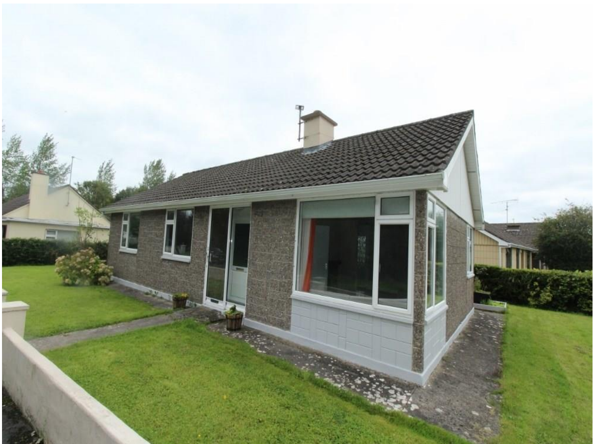
2 Brookvale Avenue, Roscommon Town, F42 FH48