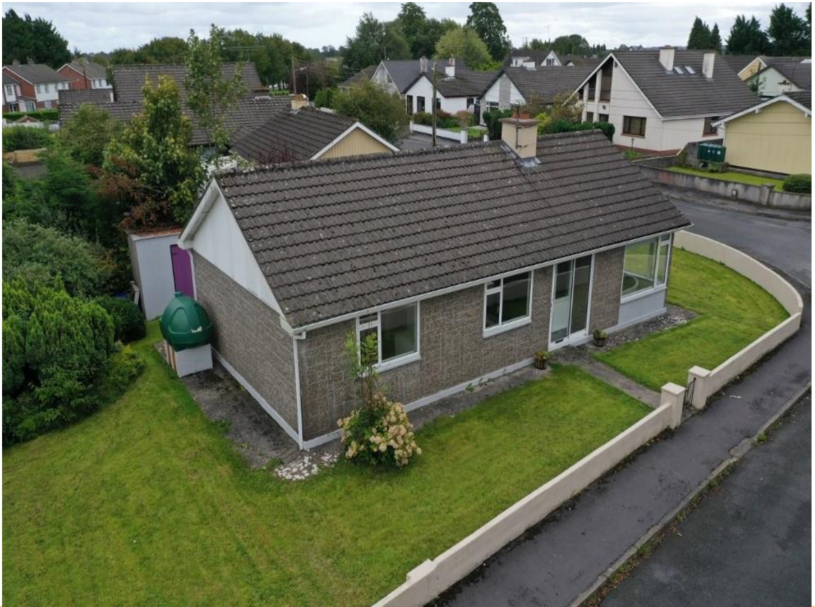
2 Brookvale Avenue, Roscommon Town, F42 FH48