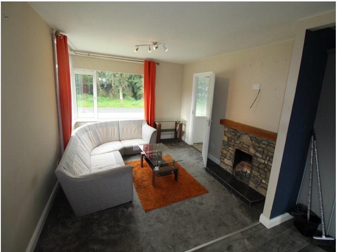
2 Brookvale Avenue, Roscommon Town, F42 FH48