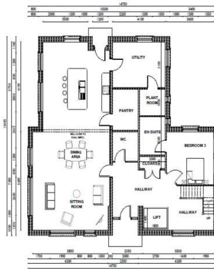
PROPOSED GROUND FLOOR PLAN 1:100 PROPOSED GROUND FLOOR AREA 147.40 SQ METRES (1586 SQ FEET) TOTAL FLOOR AREA 299.20 SQ METRES (3219 SQ FEET)