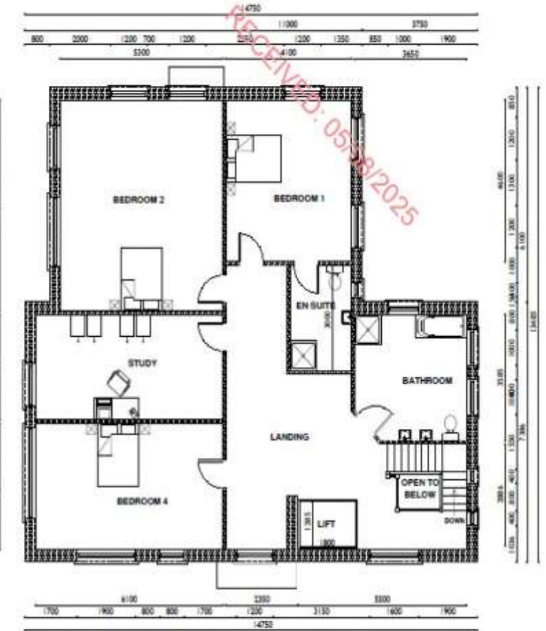
PROPOSED FIRST FLOOR PLAN 1:100 PROPOSED FIRST FLOOR AREA 151.80 SQ METRES (1633 SQ FEET)