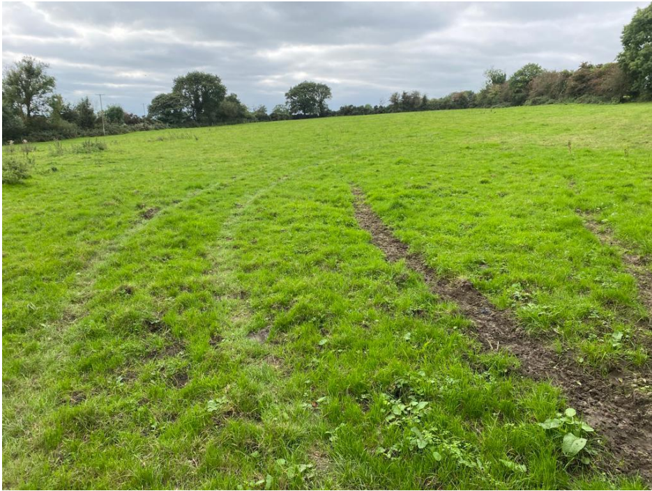
Paddock 1 – Above Farmyard