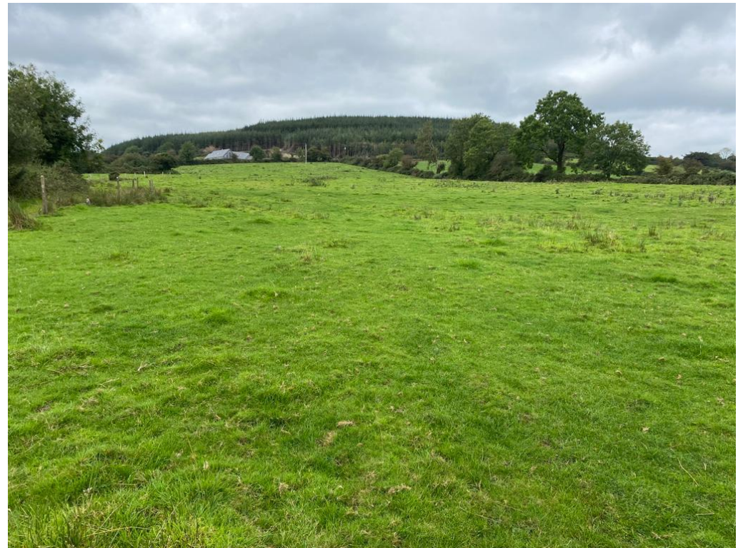
Roadside Field with Site potential

This is a good parcel of grassland in five divisions with an old Farmyard and derelict Farmhouse at the lower end of the Farm.