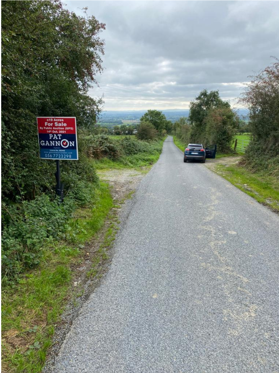
Main Road with entrance below Auction sign

For Sale by Public Auction unless previously sold