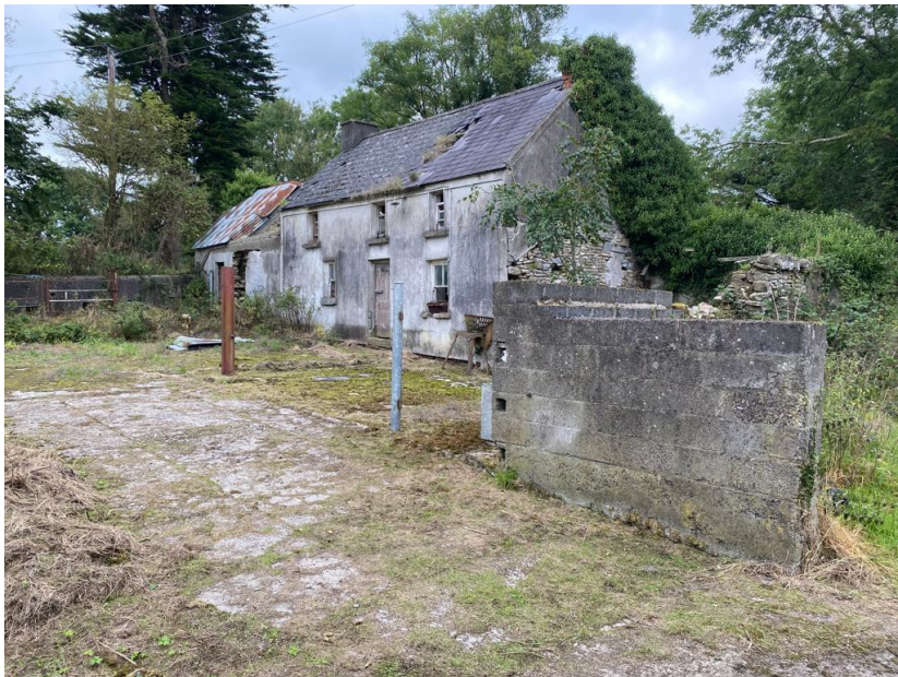
Farmhouse part of Farmyard