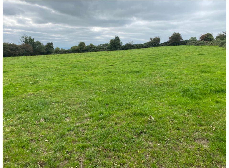
Paddock 2 – Beside Paddock 1