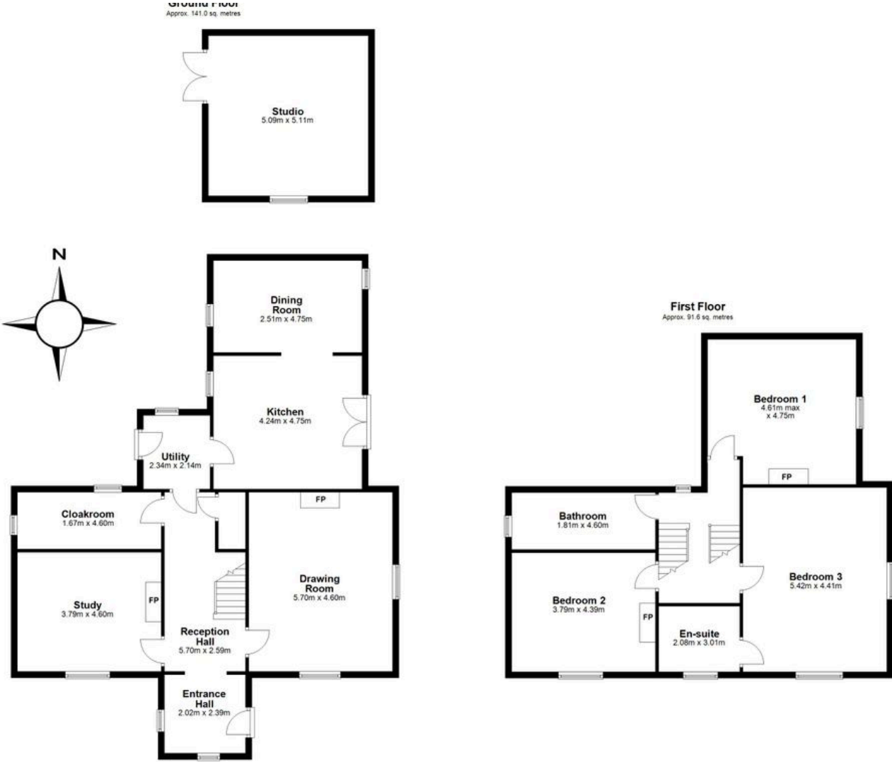
Tinahely House, Ballinacor, Tinahely, Co Wicklow