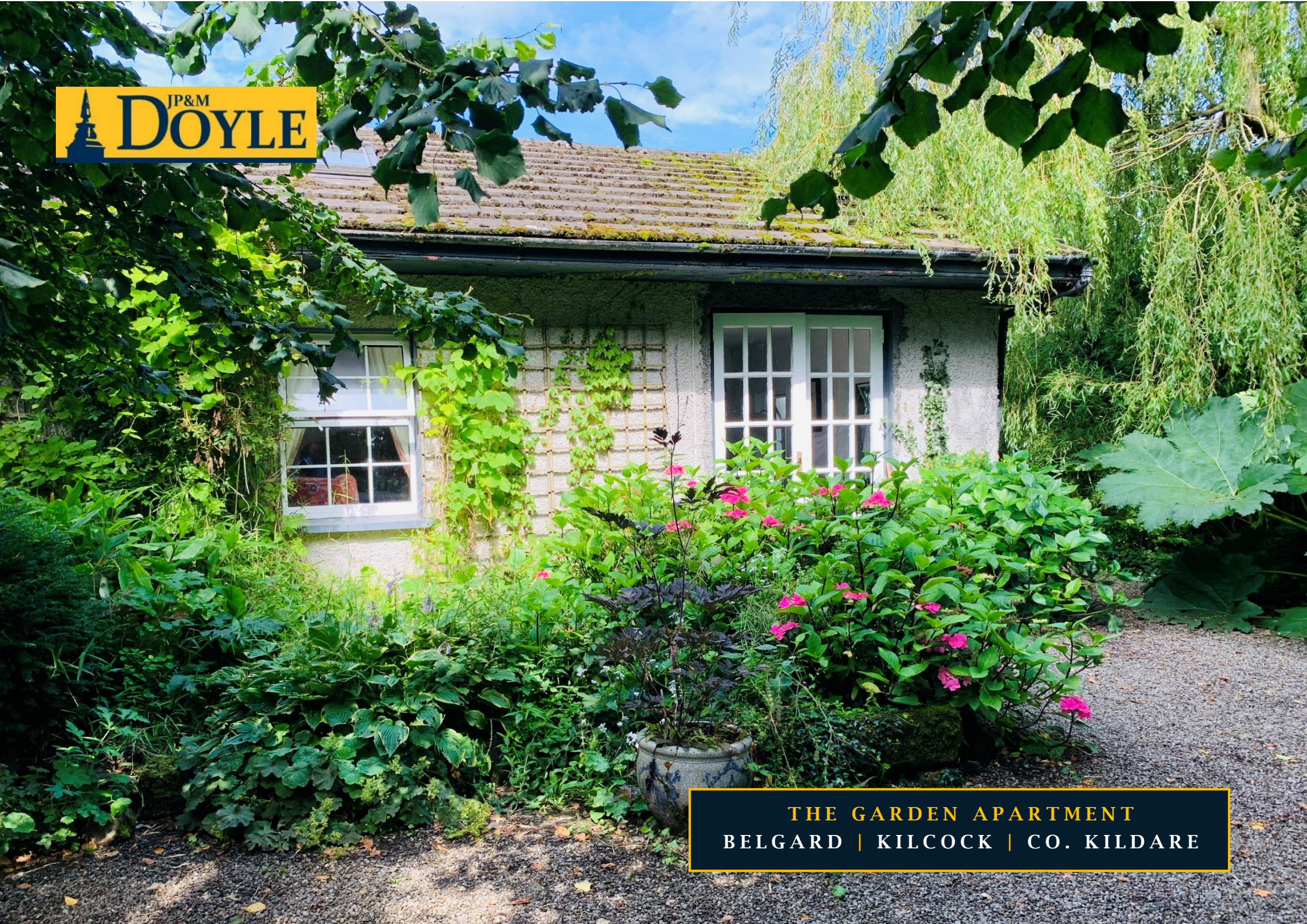
THE GARDEN APARTMENT BELGARD | KILCOCK | CO. KILDARE