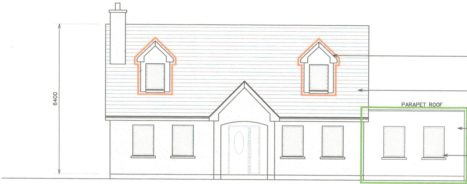
PROPOSED FRONT ELEVATION (WEST) SCALE 1:100