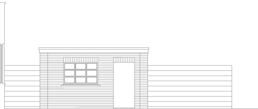
OFFICE ELEVATION (West)