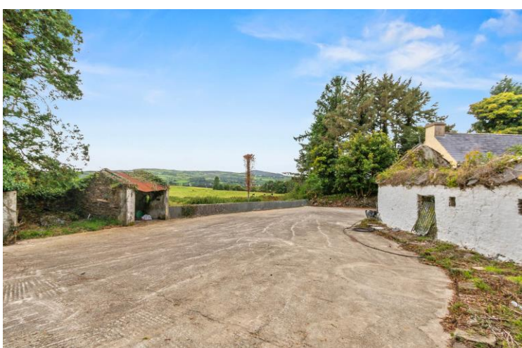
TRADITIONAL FARM HOLDING COMPRISING DWELLING HOUSE, OUTBUILDINGS AND 18 ACRES APPROXIMATELY OF ORGANIC LANDS, COMMANDING A FULL SOUTHERLY ASPECT AND LOCATED JUST 8 MILES APPROXIMATELY FROM THE VIBRANT WEST CORK TOWN OF CLONAKILTY.

We expect that this property will qualify for the Vacant Property Refurbishment Grant.